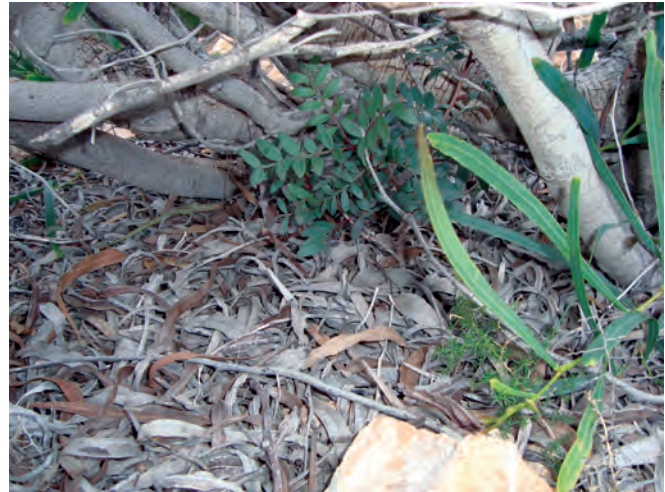
Fig. 3. Lampedusa, Locality Taccio Vecchio: saplings of Pistacia lentiscus under Acacia cyclops canopy.

Owing to its strong drought tolerance, we assume that the expected reduction of rainfall in future decades will not hamper the local expansion of A. cyclops . On the contrary, more severe stresses may improve its competitive ability against native woody species. In fact, despite the presence of natural regeneration of Thymbra capitata (L.) Cav., Thymelaea hirsuta (L.) Endl., Pistacia lentiscus L., Prasium majus L., Asparagus aphyllus L. and Ceratonia siliqua L. (Fig.3), the overwhelming number of A. cyclops saplings, growing as clumps under the canopies of mother plants, suggests that facilitative conditions are much more favourable for self-regeneration than for the establishment of other co-existing species. Therefore, this alien plant may prevail over the native species listed above, at least in a long-term perspective. In fact, if we consider that Lampedusa and Linosa host many birds (Table 3) that are already known to play a role in the dispersal of A. cyclops in