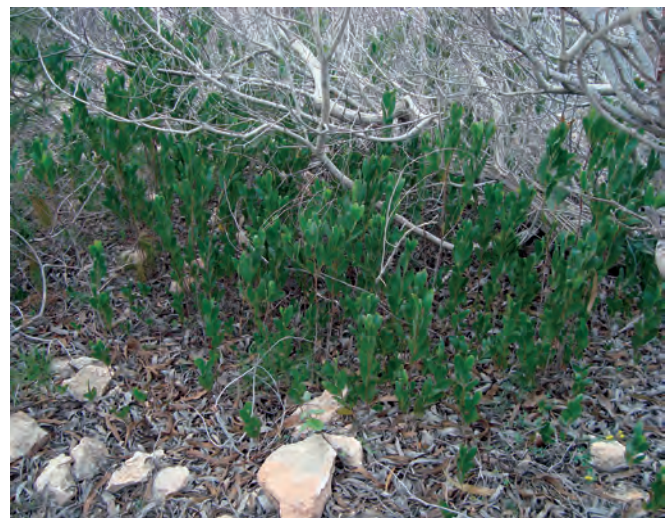
Fig. 2. Lampedusa, Locality Taccio Vecchio: vigorous germination under Acacia cyclops canopy.

A. cyclops is about 6 ha on Lampedusa (5 ha in Contrada Taccio Vecchio + 1 ha in Contrada Sanguedolce) and about 0.3 ha at Linosa. Although the most intense renewal and spread of the invading species has been recorded within afforested