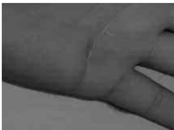
Figure 4. Regression of the nodule after phenobarbital replacement with carbamazepine.

performed a selective fasciectomy, removing the cord and a palmar nodule. A nodule shape recurrence appeared at the palm after three months from the surgery. At the same time, the neurologist replaced the phenobarbital therapy with carbamazepine (100 mg/day), to reduce side-effect regarding sedation of cognitive functions. The nodule disappeared and no other recurrence of fibromatosis developed to date.