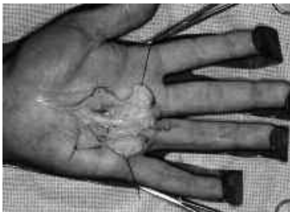
Figure 1. Intra-operative view.

He underwent selective fasciectomy, applying a Skoog incision (Figure 1), and starting, as soon as possible, physical therapy (3 sessions for 30 min/week, up to 8 weeks with home exercises) with the improvement of the finger extension (Figure 2). Four months after surgery a palmar recurrence in nodule shape occurred (Figure 3).