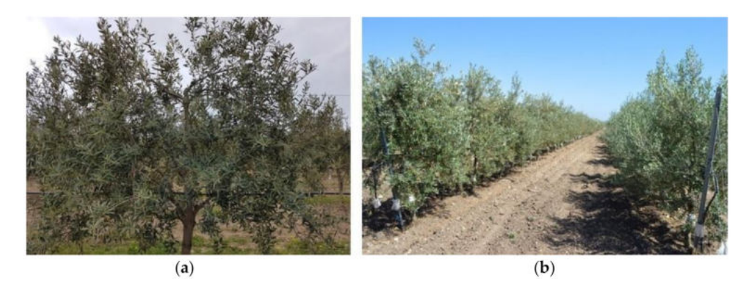
Figure 2. Example of high-density "pedestrian olive orchard" in southern Sicily: ( a ) "Calatina" olive tree trained to "free palmette"; ( b ) continuous walls of "Calatina" trees trained to "free palmette".

After more than 15 years of trials with a wide array of Sicilian cultivars with different vigor, growth and fruiting habits, the results obtained with this new type of planting, which we call "pedestrian olive orchard" similar to fruit crops, are definitely interesting; hence, the cultivation model is to be considered mature to be further investigated. From recent trials with a selected number of major and minor Sicilian genotypes, low vigor cultivars that are early fruiting, highly productive, with flexible, weeping branches have resulted in the most suitable for high-density pedestrian olive orchards. For example, minor cultivars like Calatina planted at 5 \times 2 m have reported more than twice the yield efficiency (in kg of olives per m<sup>3</sup> of canopy) and yield per ha compared to major cultivars like Nocellara del Belice (Caruso, unpublished data) over the first six years from planting. It is, therefore, generally believed that in the various olive-growing areas of the world, the model should be developed with low vigor, native cultivars to be more easily transferred to growers with specific indications on the cultivation protocols to be followed in particular pruning, fertilizing, and irrigation. In short, it is a matter of developing, starting from the aforementioned reference model, plantings suitable for specific regional/district areas and this unlike super-intensive plantings, which are based on cultivars with global agronomic potential.