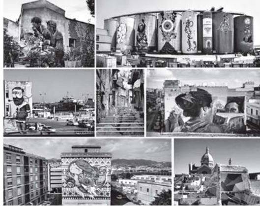
ID 145 Renewed Sicilian Urban Landscapes. Transformation, Regeneration and Reuse of degraded areas