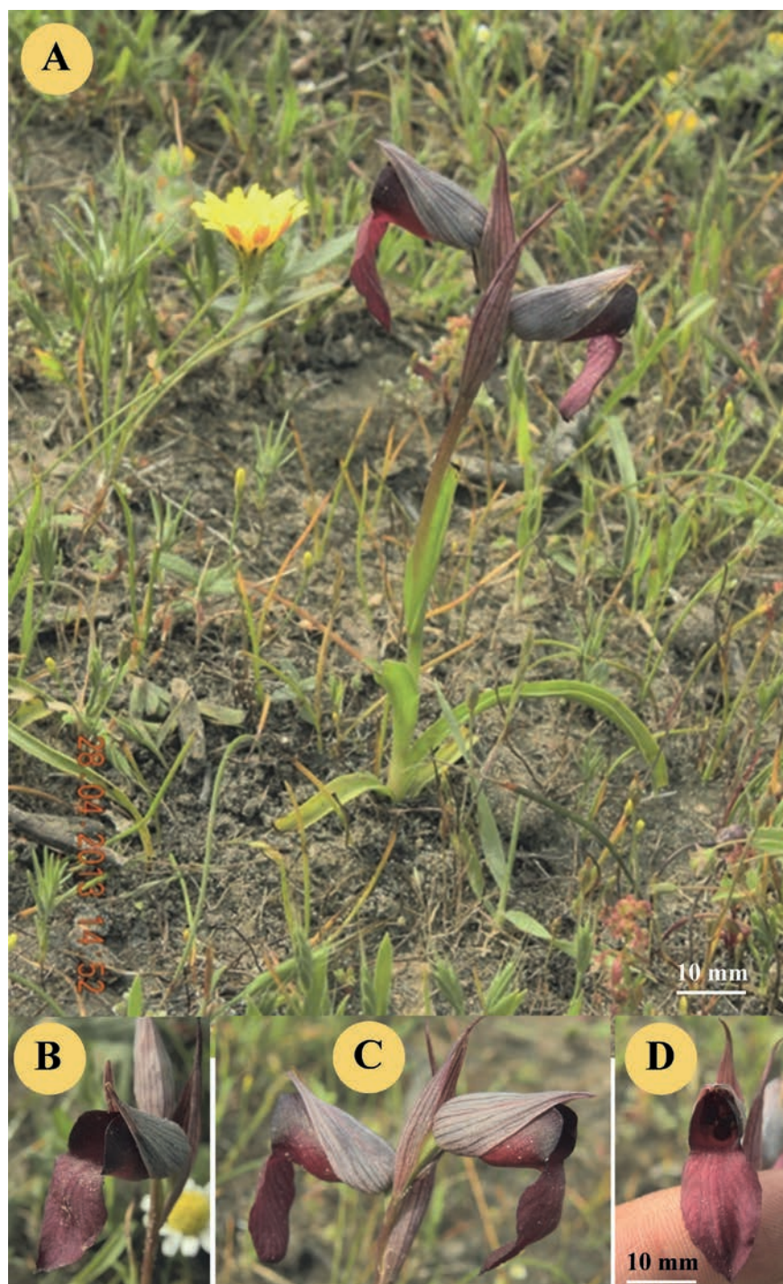
Figure 2. Serapias lingua subsp. tunetana from Cap Bon, northeastern Tunisia: (A), habitat and habit; (B), front view flower; (C), three-flowered inflorescence; (D), typical oval epichile (April 28, 2013).

base acuminate into a slender labellum by a constriction divided into hypochile and epichile; hypochile 8–13 mm long and 18–24(26) mm wide; lateral lobes inwardly replicated but still largely visible, purple with a red colored center; hypochile with a deeply grooved stigmatic surface; epichile