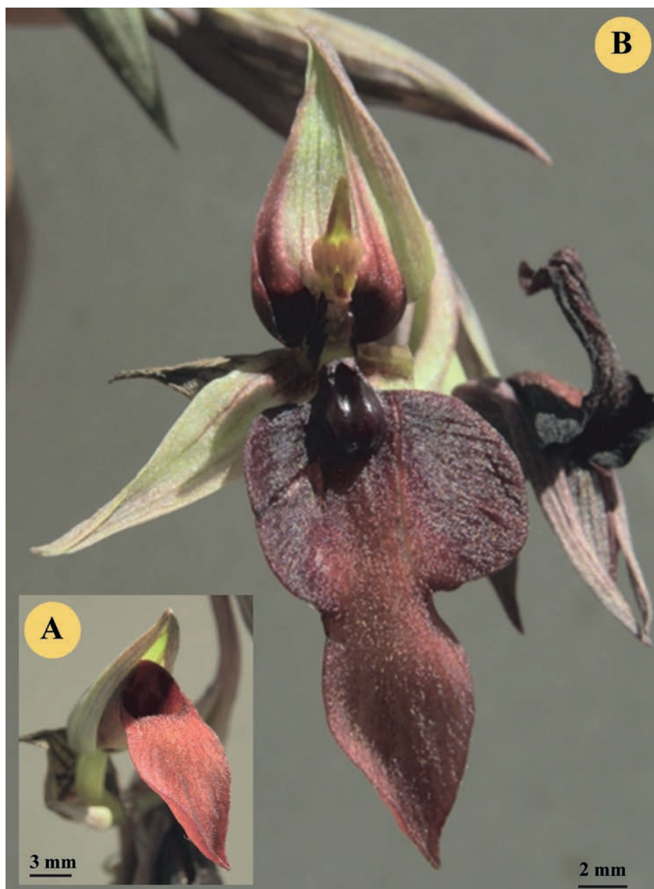
Figure 3. Serapias lingua subsp. tunetana from Kroumiria, northwestern Tunisia: (A), front view flower; (B), open flower with typical lanceolate epichile (photographs: R. El Mokni, May 15, 2014).

[= S. lingua subsp. duriaei (Batt.) Soó] mainly by the shape and size of the lip (see Table 1 and Figs. 2, 3 and 4). The difference in the size of the epichile included in the original description by Baumann & Baumann (2005; i.e. 7–10 × 4–7 mm) and that measured by us (14–19 × 8–11 mm) may due to the small number of observations made by the describing authors that accentuated the values measured on some individuals with smaller flowers, due to particularly dry years.