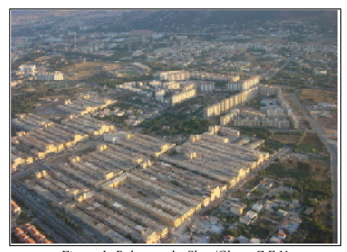
Figure 1: Palermo, the Slum/Ghetto Z.E.N.

Poverty is a complex and multi-dimensional phenomenon with specific historical, economic, social and political origins, which manifests itself in a variety of forms. Poverty is conceptualized not merely in terms of income and assets but also in terms of human capital factors. Concerning our field experience in Palermo (Sicily, Southern Italy), in the dangerous slum named Z.E.N. (North Zone Expansion), which is the context in which we operate, the burden of deprivation and poverty is photographed by some variables that distinguish different shapes and dimensions of poverty: economic poverty (lack of regular work, a secure income, etc.), urban planning (lack of adequate housing in good condition, lack of urban communities, etc.), political agenda (absence or low proportion of institutions in the area and/or the presence of mafia networks), socio-cultural poverty (low educative levels, school drop-spread, reproduction of cultural backwardness and outdated patterns), relational poverty (lack of capital made up of a relationship of trust you can count on, existential loneliness, family breakdown or oppressive family ties, etc.).