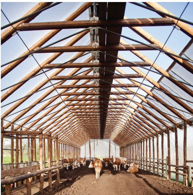
Figure 4. Barn for end-of-use disassembly and reuse of materials (Coop Tesori Bio farm, Cuneo, Piedmont, Italy).

Future housing designs are expected to combine features of FW and CB. For example, FW could be used for young stock, dry cows, special needs cows, and fresh cows that benefit the most from the soft surface and large space allowance. The management of bedding in FW is easier for young stock and dry cows, because the amount of moisture from these animals is much lower per animal than from high-producing cows. In such a system, high-yielding dairy cows could be kept in well-designed cubicles with animal-friendly bedding, such as deep sand, and with low-emission walkable floors. Alternatively, the FW area could also be implemented as an environmental and welfare-friendly exercise area