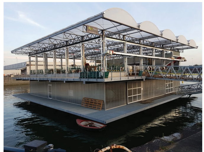
Figure 7. Floating dairy farm in Rotterdam, the Netherlands.

In most countries, dairy farming is a land-based enterprise. Farmers use roughage and sometimes (part of the) concentrates from their own land. A land-based system decreases the import of feed and export of manure at the farm level. However, in many countries, urbanization is ongoing, and people are relocating from rural to urban areas. This trend prompts the question of whether animals should be kept close to where the feed is produced or where the animal products are consumed. If waste from cities and industry can be used as feed for animals, a city-based farming system could be an alternative. The floating farm in the Port of Rotterdam is the first floating dairy farm in the world to be based on this idea (Figure 7). It is an innovative concept that represents a circular means of producing food close to the consumers in the city; it was developed by Peter van Wingerden (Beladon Inc., Rotterdam, the Netherlands), who used to work on floating constructions. He suggests that this type of dairy housing would be suitable for cities situated in delta areas, thus reducing transport costs to consumers and benefiting from local residual flows from existing sources of production, such as waste products from breweries, mills, and potato processing. Circularity is an essential principle for floating farms and future farms in general. Water supply and drainage, generation of energy, waste process-