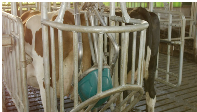
Figure 3. CowToilet for collecting urine from the cow (Hanskamp, Doetinchem, the Netherlands).

In recent years, animal welfare, reduction of GHG emissions, and manure quality in relation to soil structure and soil life have become more dominant concerns. The future of FW and CB depends on combining this aspect of manure quality with the other sustainability criteria. The design of a cow barn affects manure quality, which is important for use as fertilizer or soil improver on grassland and arable land, and for decreasing ammonia emissions. In this context, the economic value of 10 manure products has been evaluated (van Dijk and Galama, 2019) from the perspective of the dairy farmer who delivers it and the arable farmer who receives it. The revenues relate to fertilizer savings (N, P, and K) and OM supply for improving soil fertility and quality and crop production. The total costs include the cost of an adapted housing system, (mechanical) separation, sampling and analysis, and transport and application onto the field. Organic manures from straw bedding are of interest as fertilizers and soil improvers, but the benefits must be weighed against the relatively high cost of straw. Therefore, farmers are searching for inexpensive bedding materials with high OM content that can be used in CB or FW barns. Mechanical separation of solids and liquids is expensive and might increase emissions. Consequently, primary separation of feces and urine with a different floor type in CB systems, use of a CowToilet, or separation by using an artificial