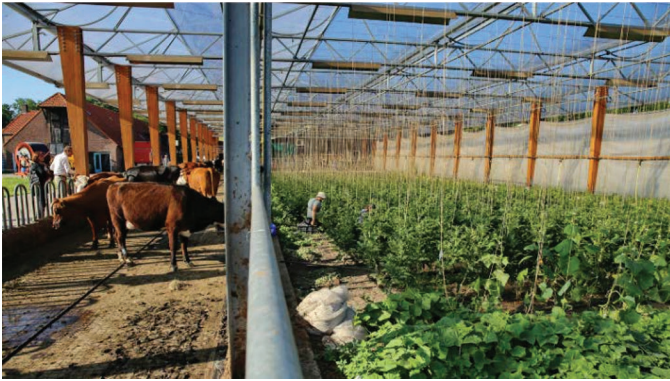
Figure 5. Use of composted bedding in freewalk housing for horticulture during the grazing period (Veld en Beek, Doorwerth farm, Heeslum, the Netherlands).

adjacent to the building. Based on information from sensors (ear, neck, or leg) or cameras, problem cows could be selected using selection gates to provide them with more space in the FW area inside or outside the main building.