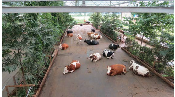
Figure 2. Cow garden with artificial floor separating urine and manure, and small trees for shade and a natural look (Kraanswijk farm, Groenlo, the Netherlands).

A manure robot completes the artificial floor FW system. The robot collects manure from the upper layer of the artificial floor and deposits it in a central gutter. This collection technique differs from other techniques of sucking or pushing the manure. The manure robot was developed to clean the floor 3 to 6 times per day, depending on the area per cow (10 to 16 m 2 per cow). A limited number of artificial floor FW barns are in operation or in the process of being built in the Netherlands, Slovenia, and Germany (approximately 10 farms, including experimental farms). Observations with this floor system have revealed several factors critical to