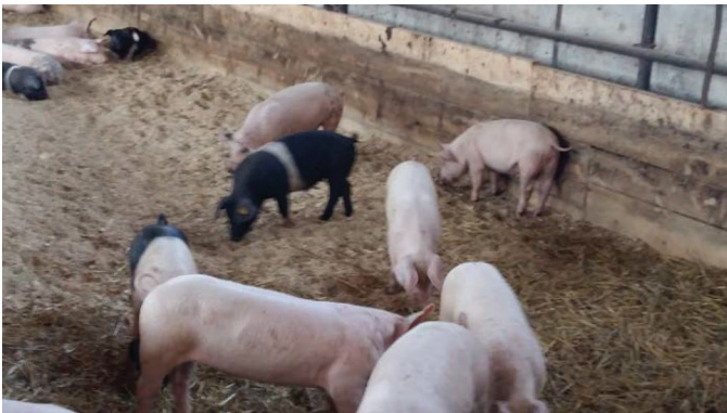
Figure 6. Use of freewalk housing for fattening pigs during the grazing period (Logatec farm, Slovenia).

To increase the capital efficiency of a building, one option is to use the building for other activities in the summer, when cows and young stock are grazing. Milking can still take place in the parlor if the layout is appropriate. Figure 5 shows the use of the building for horticulture (example in the Netherlands), and Figure 6 shows the use of the building for fattening pigs (example in Slovenia). When using the building for horticulture, sufficient light in the building is important, and extra soil on top is needed to grow paprika, tomatoes, or other vegetables or fruits. For fattening pigs, it is important to check for any risk of pig infection by bacteria in the bedding material. Experience from the Educational Research Centre Logatec (Logatec, Slovenia) in recent years has not indicated adverse effects on