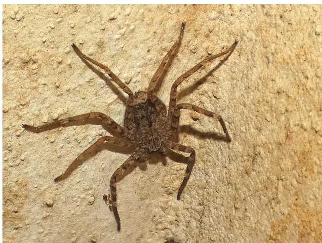
Fig. 3: One of at least six different individuals of S. radiatus observed inside the same inhabited house on the island of Filicudi (Aeolian Archipelago) in October 2023.

Most individuals were observed inside or around inhabited houses (Fig. 3), just like the first record in Sicily (Lo Cascio & Grita 2010). This is in accordance with many observations from the Afrotropical region (Lawrence 1940, Corronca 2000, 2002). Our data clearly demonstrate the synanthropic habits of this species. In addition, Lawrence (1940) described the genus as being attracted by light and to be found resting on inside walls at night, which might further explain why it is frequently observed by citizens, but rarely collected by scientists.