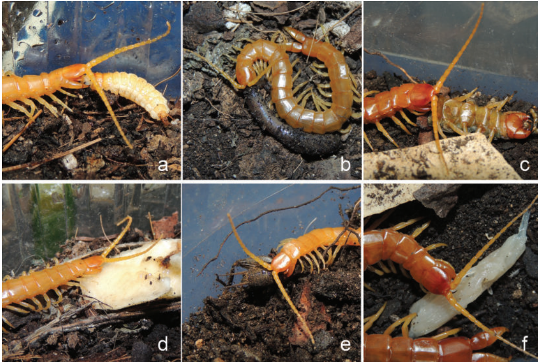
Figure 5. Foraging in captive Plutonium zwierleini . (a) Staphylinidae larvae; (b) Lumbricidae; (c) Scolopendra cingulata ; (d) Banana; (e) Gryllidae; (f) Raw chicken meat.

species. To date, there is still no past and present evidence of the presence of P. zwierleini from north-eastern and south-eastern Sicily (cf. Bonato et al. 2017), i.e., from the Peloritani mountains and Hyblean area; however, the latter area has only been marginally investigated in the frame of our fieldwork (Table I and Figures 1 and S1). Accordingly, a low probability of presence in south-eastern Sicily is also supported by the low values based on the maximum entropy of the climatic niche (Figure 4). The species distribution modelling aligns with our novel observations and is consistent with records obtained from the literature spanning from 1881 to 2017 (Figure 1) (Bonato et al. 2017 and references therein).