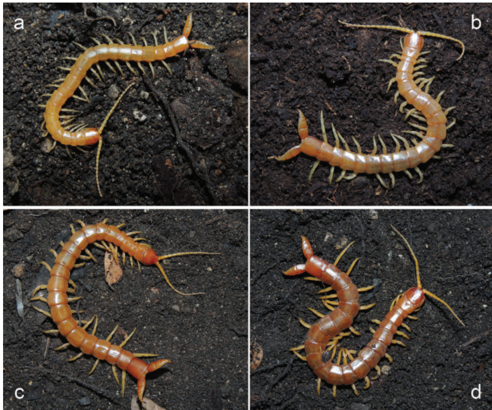
Figure 2. Four of the Plutonium zvierleini individuals collected in the field and photographed in a controlled environment. (a) 44 mm total length from Castelvetrano (Trapani province, locality #4); (b) 63 mm total length from Piana degli Albanesi (Palermo province, locality #19); (c) 102 mm total length from Castelvetrano (Trapani province, locality #4); (d) 114 mm total length from Castelvetrano (Trapani province, locality #4).