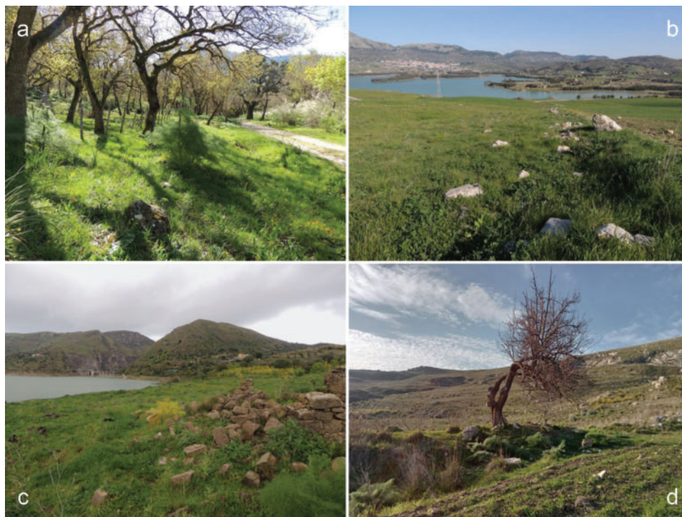
Figure 3. Four of the Plutonium zwierleini habitat in Sicily. (a) Near Ficuzza, Monreale (Palermo province, locality #18); (b) Piana degli Albanesi (Palermo province, locality #19); (c) Caccamo (Palermo province, locality #20); (d) Alimena (Palermo province, locality #17).

The three captive Plutonium zwierleini individuals showed highly secretive habits. Most of the time was spent under the shelters. The activity took