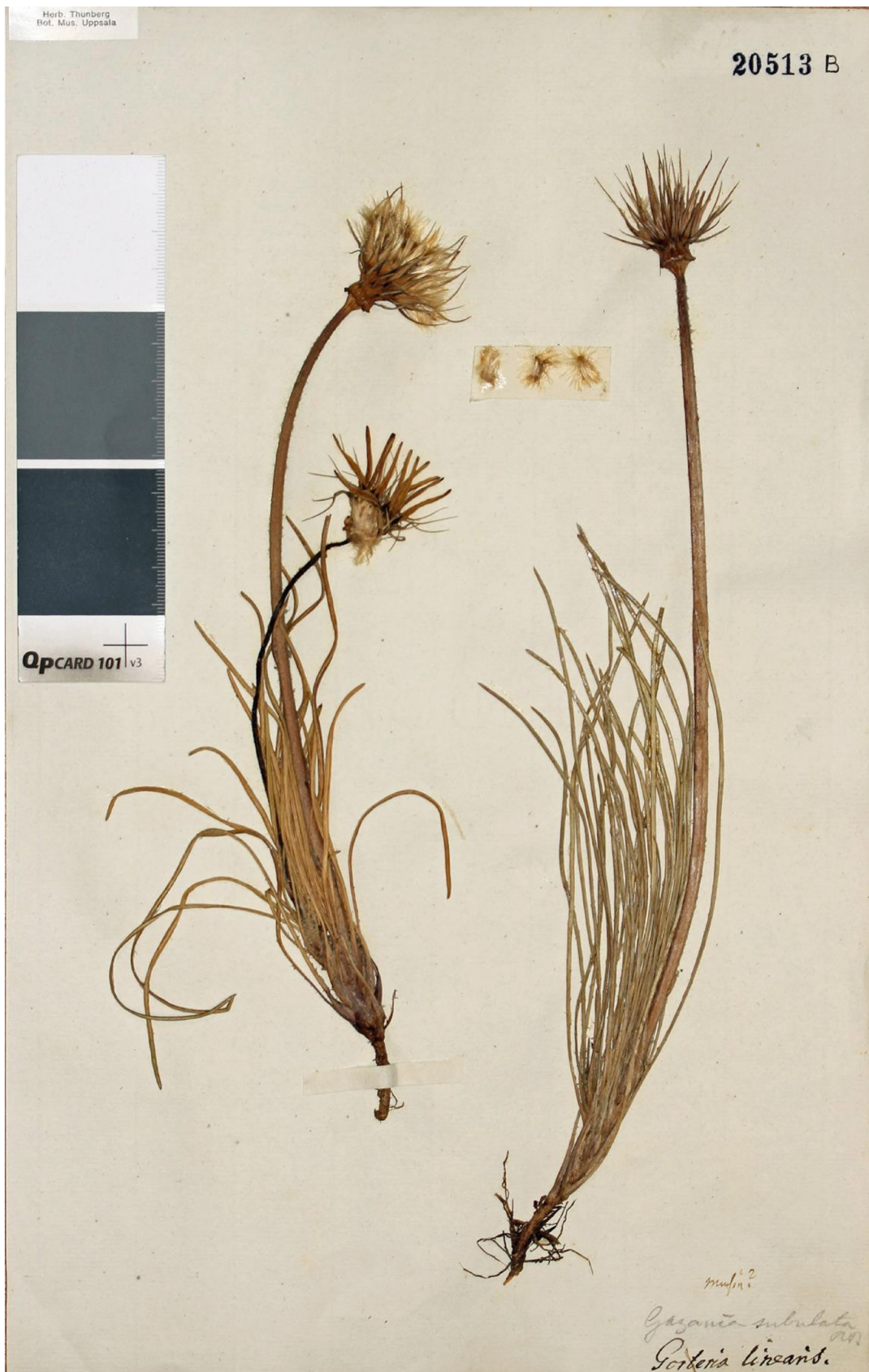
Figure 3. Lectotype of Gorteria linearis (designated here). Origin: South Africa, Cape Province, e Cap. b. spei (Thunberg's handwriting), Thunberg s.n. (UPS-THUNB20513B, 2020).

Distribution and habitat. The genus Guizotia Cass. (Heliantheae Cass.) consists of six species, five of them are native to the Ethiopian highlands in tropical Africa (Baagøe, 1974; Bekele et al. , 2007). Guizotia abyssinica is a species native to East Africa that occurs in Ethiopia