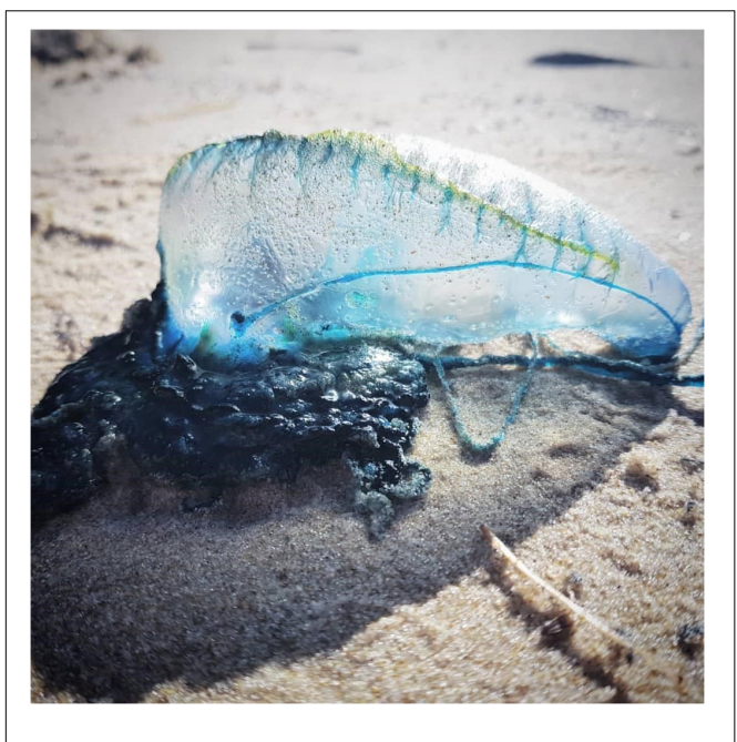
FIGURE 4 The colony of P. physalis recorded in the north-western coast of Sicily, southern Tyrrhenian basin in 2021.

were registered in the Strait of Messina, of which five were at low-risk and one at medium-risk .