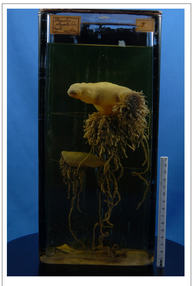
FIGURE 3 | The two colonies of P. physalis collected in the Gulf of Naples (Italy) in 1914, preserved at the "Darwin Dohrn" Museum of Naples (photo by Akira Kihara, Science Center, Hosei University, Tokyo; ©2007 Zoological Collection Database Stazione Zoologica "Anton Dohrn").

A portion of the records of P. physalis was grouped in four Italian biogeographical sectors: Sardinian waters, Channel of Sicily, Tyrrhenian Sea, Strait of Messina, mainly around the Sicily