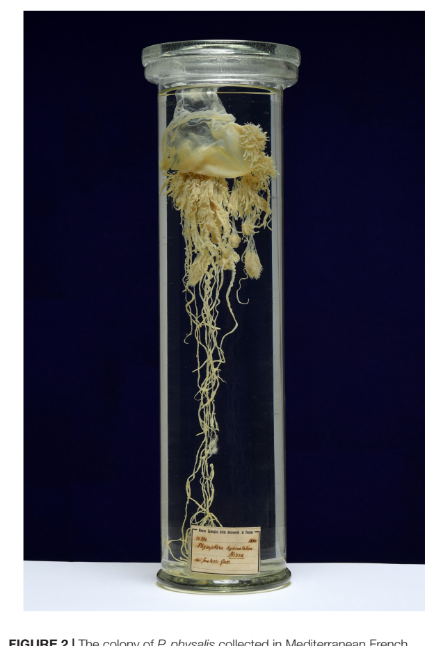
FIGURE 2 | The colony of P. physalis collected in Mediterranean French waters (Nice) in 1850, voucher code MZUF-uncatalogued, preserved at the Natural History Museum of the University of Florence.

recorded in the Alboran Sea area, probably due to the action of the Western Alboran Gyre (WAG) and Eastern Alboran Gyre (EAG) (Poulain et al., 2012). Such surface currents of the Alboran Sea can behave also as physical barriers to the flow toward the western Mediterranean, as suggested by Prieto et al. (2015), limiting the easternmost circulation of a large number of P. physalis colonies. Only a few colonies that escape the front manage to circulate by the benefit of the surface currents present in the Mediterranean Sea (Poulain et al., 2012). By creating a map of the P. physalis records documented in the last century, and superimposing it with the trajectories of the surface currents that drive the colonies (Poulain et al., 2012), it has been shown a general pattern of occurrence of the Portuguese man-of-war within the Mediterranean Sea ( Figure 1 ).