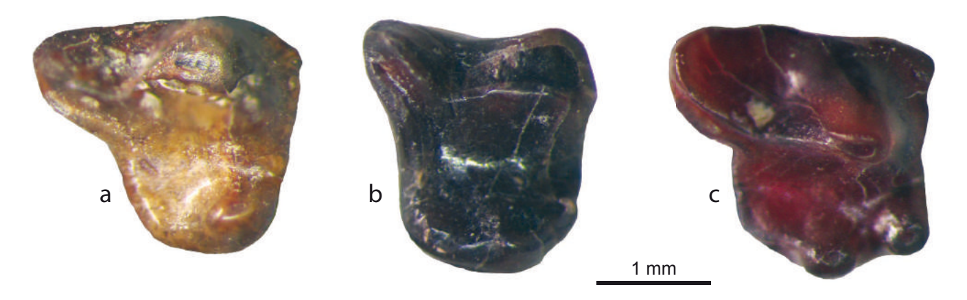
Text-fig. 2. P3, morphotypes of Parasorex depereti from BRS 25. a) P3 with only one lingual cusp, hypocone. b) P3 with fused protocone and hypocone, forming a ridge-like complex. c) P3 with well-developed protocone and hypocone. Scale bar 1 mm.

The canines, and the first lower and upper incisors can be easily distinguished from the other unicuspid teeth. More difficult are the second and third upper and lower incisors. In the case of the examined material, it is still difficult to assess if whether the BRS hedgehog had three or two lower incisors. In the upper anterior tooth row, I2 is usually larger than I3, P1 has a simple, single-cusped crown and two fused roots, between which lies a shallow vertical groove that separates them. P2 is much larger, has a talon-shaped