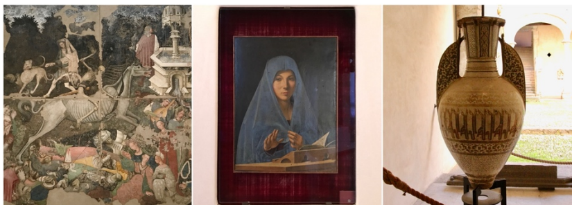
Fig. 2. From left to right Triumph of Death , Virgin Annunciate , “ Alhambra ” Malaga Amphora.

The bi-metallic reactive coupons were placed in the exhibition halls hosting the three considered artefacts using small wooden frames; moreover, another coupon was installed inside the Virgin Annunciate case, in order to detect possible micro-climatic variations between the room environment and the atmosphere surrounding the painting.