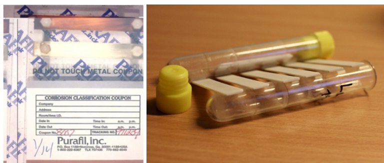
Fig. 1. Purafil TM bi-metallic reactive coupon (on the left) and marble coupons (on the right; courtesy of prof. Livio De Santoli, Università di Roma Sapienza), used for the IAQ monitoring.

The bi-metallic coupons used in the test application were the Purafil TM (Figure 1); it was therefore chosen to use the environmental classification proposed by Purafil TM company to correlate the obtained results with the levels of danger for the artefacts; in particular, the warning limits are 250–350 \text{\AA}/30 days for copper corrosion and 200–300 \text{\AA}/30 days for silver corrosion [28, 29]. As a precaution, the overall threshold for which attention is required was set at 200 \text{\AA}/30 days.