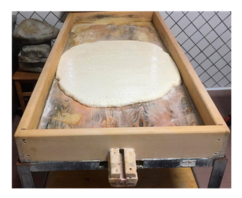
Figure 1. "Mastredda", a wooden table used for curd acidification during PDO Provola dei Nebrodi cheese production.

The acidification process is particularly important for stretched cheeses because a pH drop in the range 5.2–5.4 is necessary for stretching [21,22], since dicalcium paracaseinate is converted into monocalcium paracaseinate determining the formation of fibres that can be reorganized to give shape and sheen to the cheese [23]. A pH value > 5.4 does not allow stretching of the curd, while at pH below 5.2 the acidified curd is too tough due to the excessive fat loss [24]. After draining, the curd for PDO Provola dei Nebrodi cheese production is traditionally left to acidify at room temperature for about 24 h on a wooden open-topped table, namely "mastredda" [3] (Figure 1).