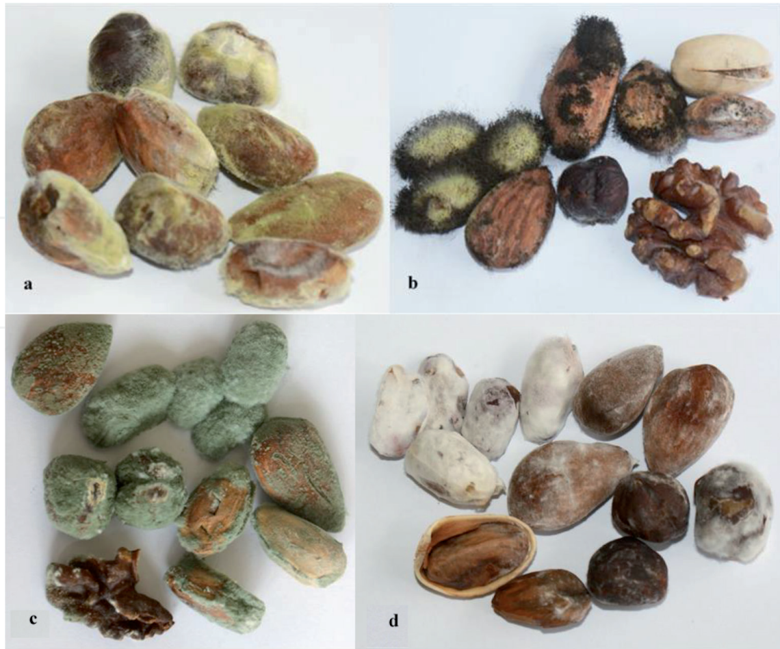
Figure 2. Nuts contaminated with Aspergillus flavus (a), A. niger (b), Penicillium sp (c), Fusarium sp (d).

animal life. Its name derives from its conidiophore shape, with a brush-like appearance (a penicillus). It belongs to Aspergillaceae family and it's divided in 32 sections with almost 500 species; the teleomorphs are ascribed in ascomycetes genera, as Eupenicillium and Talaromyces [30]. In nature, Penicillium species live decomposing organic materials. On the contrary, other species of Penicillium are widely used in the food industry for the production of cheeses such as Roquefort and fermented sausages [41].