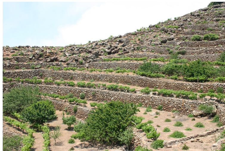
Figure 1. Traditional caper orchard on the island of Pantelleria, where sloped lands in ancient times were managed in order to obtain comfortable terraces.

cultivation is not able to meet the thriving market demand [6]. In Italy, caper cultivation, based upon local selections or biotypes [16] of C. spinosa L., domesticated in situ from subsp. rupestris [17], is concentrated in the small islands around Sicily (mostly Pantelleria and the Aeolian Islands Salina, Lipari and Filicudi). In these Sicilian areas, the species plays a significant socio-economical role [18,19] and was awarded in 1996 with the designation of UE “Protected Geographical Indication” (PGI) for the caper grown on the island of Pantelleria (Figure 1), and more recently (2020), for that on the Aeolian archipelago, by EU “Protected Designation of Origin” (PDO-IT-20A02570), under the denomination of “Cappero delle Isole Eolie Dop”. On the Aeolian island of Salina (Figure 2), a Slow Food Presidium has been active for many years, with the aim of preserving a heritage of cultural and agronomic knowledge linked to the island’s history and the resilience of its heroic agriculture [20].