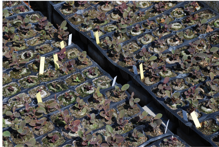
Figure 3. Experiments in seed propagation carried out in Spain at CITA by using seed of capers from Ballobar (Aragon, Spain).

stratified, opportunely moistened sand layers, each 2–4 cm high. This process takes 25 to 50 days and generally leads to a 30–40% pre-germination rate. The full emergence of the plantlets (45–50 out of the initial 250–330 pre-germinated seeds) occurs 25–30 days after sowing. Simplified direct seeding with 4–5 g seed m -2 is also reported, but with lower results in terms of plantlet emergence, with the best expectations of 30–40 plantlets m -2 .