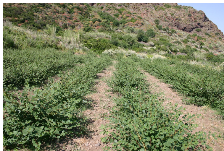
Figure 2. Intensive caper orchard on the island of Salina.

Well adapted to harsh environmental conditions [21], due to its xerophytic habit and its deep root system [22,23], its exceptional photosynthetic characteristics, maintained under high irradiance and temperature without damage symptoms [24], and its adaptation to poor soils [25], C. spinosa L., could, therefore, significantly contribute to the development of local, marginal areas [21], especially those of small islands. Additionally, caper may help preserve the equilibrium of fragile arid and semiarid ecosystems [26] by reducing the soil erosion