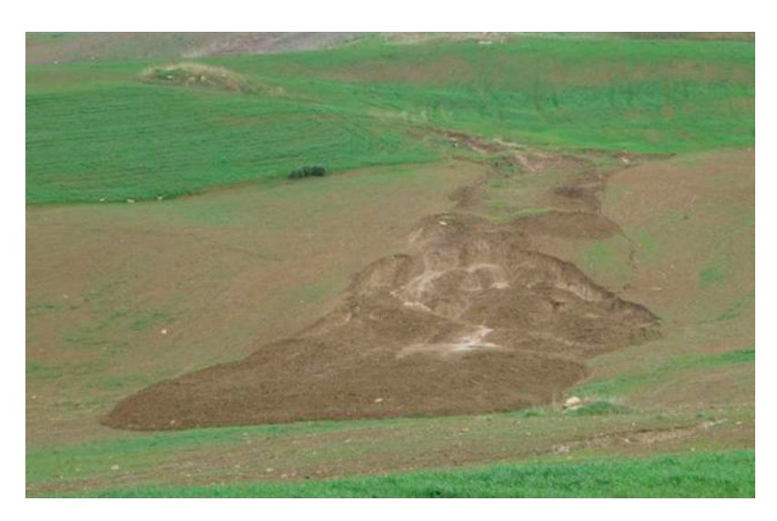
Figure 2. View of the surveyed area.

The surveyed area is located at an altitude between 500 and 700 m a.s.l. (Figure 2).