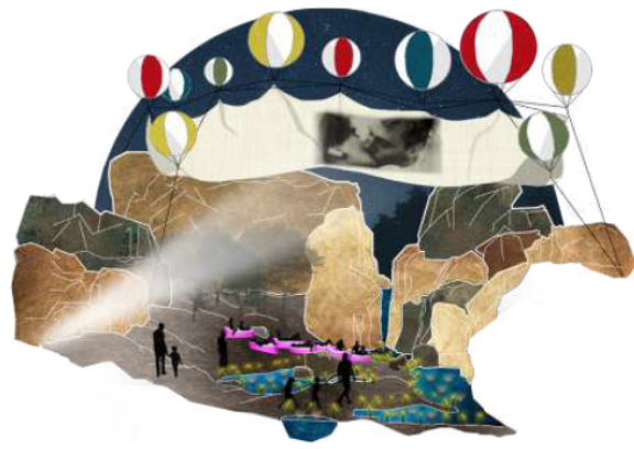
Fig.05 Above the clouds/ Sopra le nuvole (Fellinian juggling) © LabCity Architecture, 2021 Fig.06 Above the clouds/ Sopra le nuvole (Cinema Paradise) © LabCity Architecture, 2021

public to comfortably attend the shows (Fig. 06). Aim of the project-event is the construction of a temporary artificial surface on which to project, as on a screen, some scenes of Maestro Tornatore's films. On late night, the experience comes to an end by leading the spectators in the opposite direction, in a nightlike atmosphere enlightened by small artificial lights.