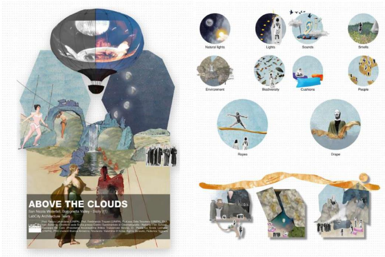
Fig.04 Above the clouds/ Sopra le nuvole (libretto's cover) © LabCity Architecture, 2021