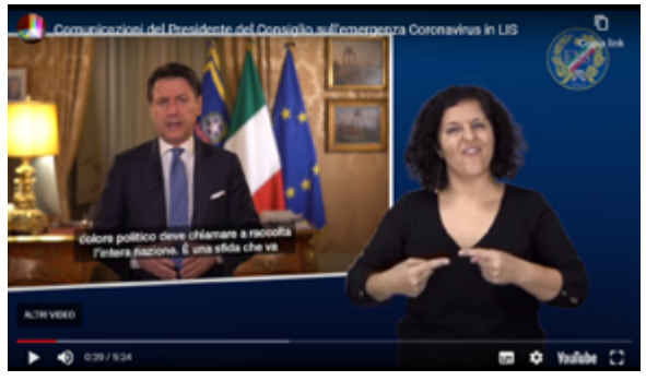
4: Translation into LIS: sFIDA (challenge) – Press Conference, March 5, 2020

3: Translation into LIS: ARRENDE+NO (does not give up) – Press Conference, March 5, 2020