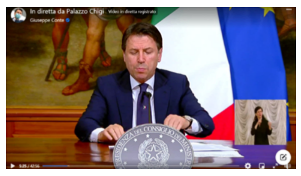
6: Translation into LIS: battere (to fight) – Press Conference, April 26, 2020

Similarly to the situation that we observed previously, these two examples here are actually quite different: the first displays an idiomatic expression that includes a war metaphor, while the verb used in the second example belongs to the language of war.