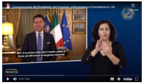
1: Translation into LIS: AFFRONTARE (to face) – Press Conference, March 5, 2020

opted are: "affrontare" ("to face"), "forte" ("strong"), "non si arrende" ("does not give up"), "sfida" ("challenge"). Of each of these we find the translation into LIS by the interpreter: