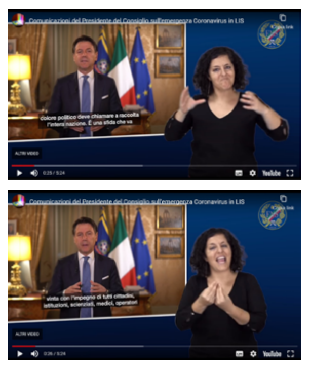
5: Translation into LIS: ITALIA PER-INTERO GRUPPO INSIEME (Italy in-its-entirety group together) – Press Conference, March 5, 2020

This second case is very different from the previous one: here the President uses an idiomatic expression, "chiamare a raccolta" (to rally), which in Italian refers to war scenarios. The interpreter's signs convey the meaning of needing to act as a united group (implicitly: avoiding internal conflict). The translation choice is certainly effective, but the metaphor gets lost.