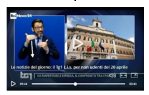
7: Translation into LIS: coprifuoco, composed of ORA + USCIRE + LIMITE (curfew, composed of hour + go-out + limit) – Rai News 24, April 20, 2021