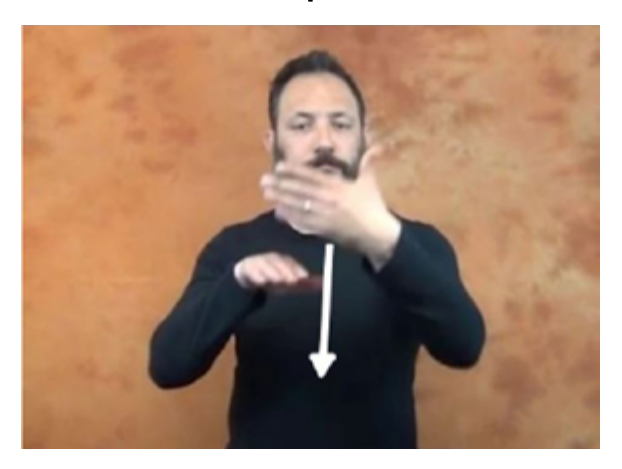
8: COPRIFUOCO, composed of ORA + LIMITE (curfew, composed of hour + limit) – Spread The Sign

Consulting the dictionary Spread The Sign <sup>25</sup>, we found this sign standing for the term curfew: