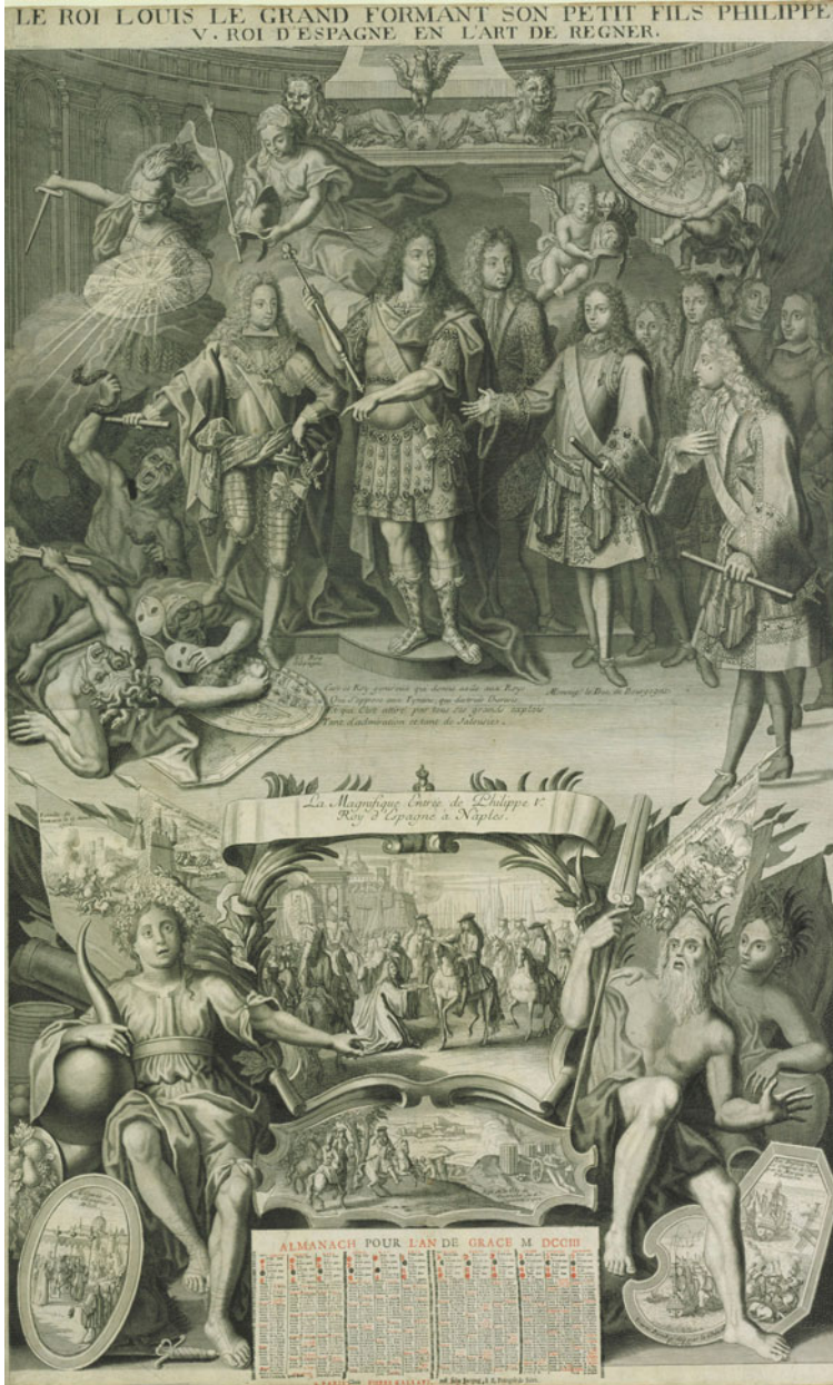
Figure 2 Almanach pour l'an de grace MDCCIII . Bibliothèque nationale de France, Paris, RESERVE QB-201 (171, 15)-FT 5. Reproduced from gallica.bnf.fr

idea expressed by this representation is clear: Philip's sceptre descends from the authority and power of Louis XIV, who helps him defeat his enemies and teaches him to defend the values of the Catholic faith. 75