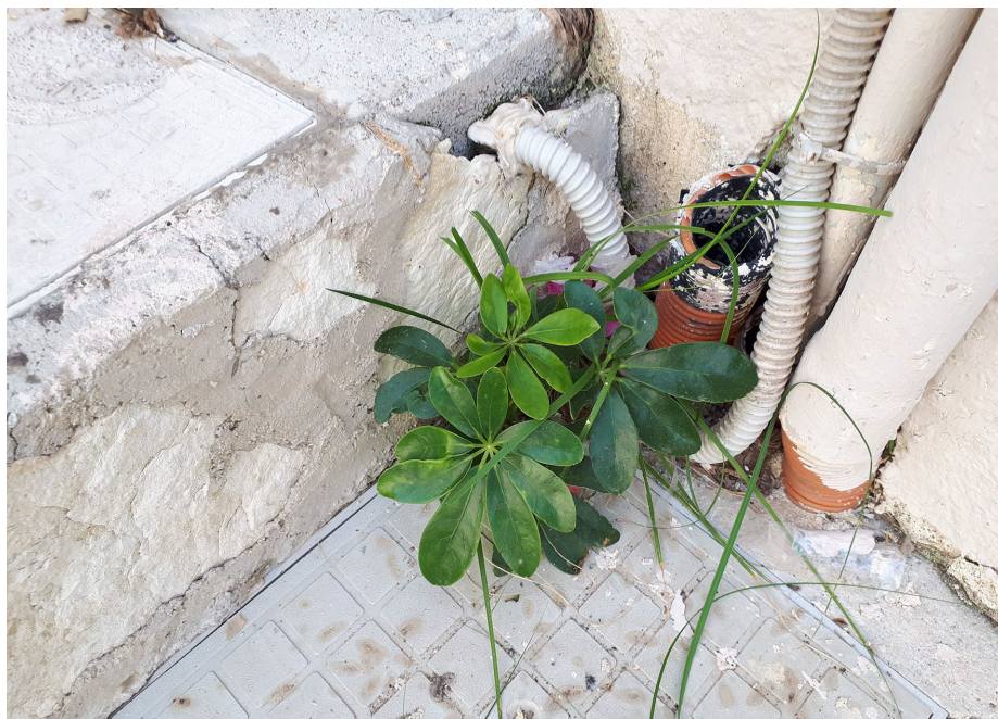
Figure 2. One self-sown individual of Heptapleurum arboricola growing at the base of a step at Via Discesa Annunziata, Castellammare del Golfo (North-western Sicily); 10 th June 2018.