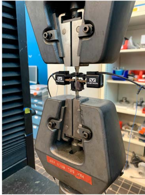
Figure 1. Tensile testing machine.