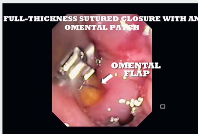
► Video 1 Simultaneous endoscopic full-thickness closure of an iatrogenic sigmoid perforation after diagnostic colonoscopy.