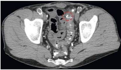
► Fig. 3 Abdominal computed tomography showing intact anastomotic site (red dashed line) with no evidence of leakage.

the patient was discharged on the following day.