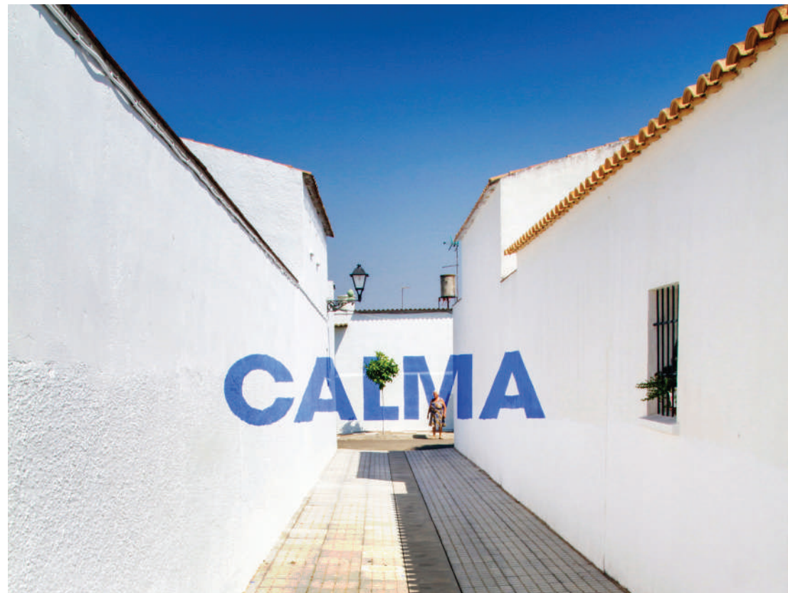
Fig. 1 - Azul sobre blanco , Cordoba, Spain, 2013 (by Boa Mistura).

anamorphosis interventions Azul sobre blanco (Blue over white) [2]. On the surfaces of small white houses, which are arranged between narrow alleys, six words materialise, blue like the colour of the sky that stands out on the white walls. Sosiego (quietude), Serenidad (serenity), Calma (calm), Remanso (haven), Claridad (clarity) and Luz (light) are the six words that summarise the life of two communities of Cordoba affected by the artistic intervention (fig. 1).