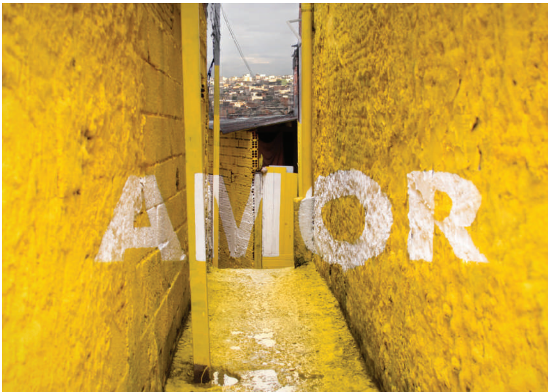
Fig. 6 - Luz nas vielas , São Paulo, Brazil, 2012. Amor (by Boa Mistura).

Anamorphosis is also used in the case of museum installations, as in the project carried out in 2018 at the MAXXI National Museum of Rome, in the context of collective exhibition “La Strada: dove si crea il mondo” [7]. Walking through a museum ramp it is possible to read three words from three different viewing spots, made with overlapping colors, through crossed anamorphosis (figs. 15-17). During a workshop given from Boa Mistura, the choice of the words Cultura (culture), Svegliata (wake up), Popolata (people) came from the answers that the participants gave the question “If the entire city of Rome