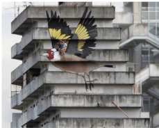
Simon Jung and Paul K. Hertz: Schweizer, The Corallo at Stampa Naples, September 2008. Cover image edited by Igor Tolosa.

SCIENTIFIC JOURNAL ON ARCHITECTURE AND CULTURAL HERITAGE