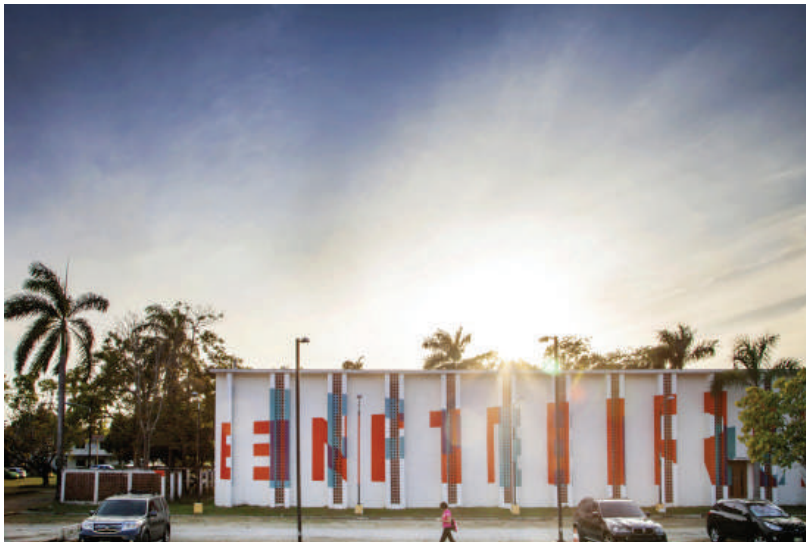
Fig. 2, 3, 4 - Pensar/Sentir , Panama City, Panama, 2014. (by Boa Mistura).

Pensar/Sentir is an intervention carried out in 2014 at the Ciudad del Saber (City of knowledge) in Panama City [3]. The artists worked with the students of the School of Architecture Isthmus using their signature anamorphic style. The chosen building is the Ecumenical Temple, turned today into an exhibition centre. In this case Boa Mistura intervenes on the building in two opposite directions, mixing on one facade the two words Pensar (think) and Sentir (feel) which can be correctly read, one at a time, from the two opposite ends. The words are two key elements in obtaining knowledge and wisdom (figs. 2-4).