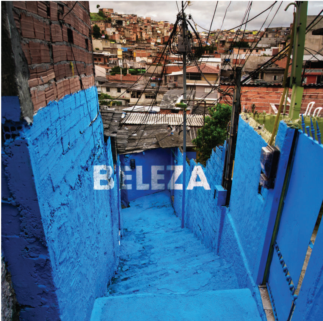
Fig. 7 - Luz nas vielas , São Paulo, Brazil, 2012. Beleza (by Boa Mistura).