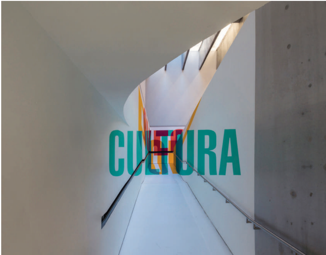
Fig. 15 - Cultura / Sveglia / Popolo , Roma, Italy, 2018. Cultura (by Boa Mistura).