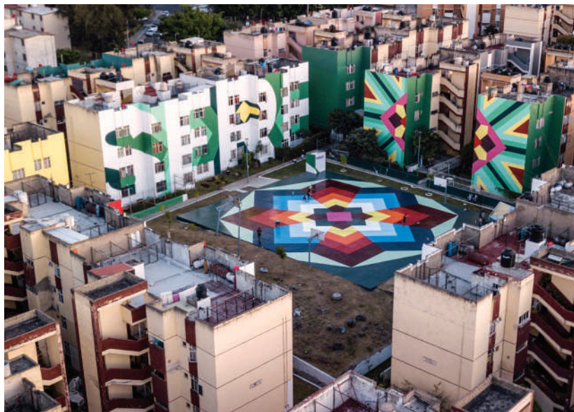
Fig. 14 - Nierika , Guadalajara, México, 2017 (by Boa Mistura).

Art is nothing more than an expression of culture, a tool to communicate what we are and our roots, that is why it is so important to keep our identities alive. We like to think that with our work we are bringing something positive to the cities. There's a friend from our neighbourhood who once told us "Doctors heal, mechanics fix cars, and artists move, touch people's hearts". For us, that is the