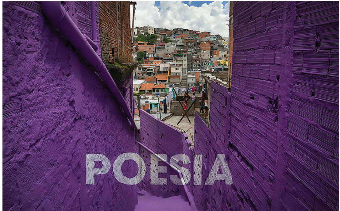
Fig. 13 - Luz nas vielas , São Paulo, Brazil, 2017. Poesia (by Boa Mistura).

After that one, others came to keep the flame lighting. The Brasilândia favela where Luz Nas Velas was born, will always be our second home for the wonderful people who welcomed us as one of the family. In the Nierika project, in Guadalajara, Mexico, together with the neighbours, we managed to transform the use of a square so that it would stop being a drug selling point and begin to be used by the children and elders of the community; in Buenaventura, Colombia, in the houses of this humble coastal community we could see the marvellous style of