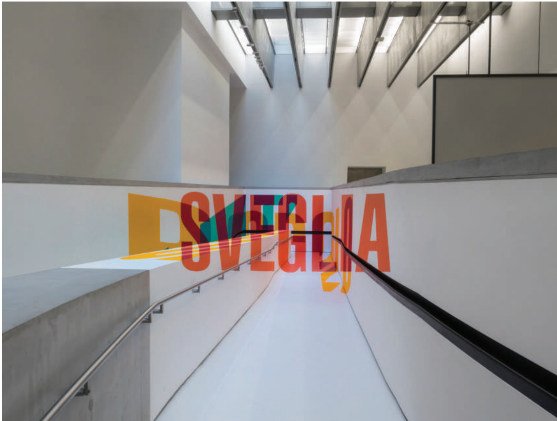
Fig. 17 - Cultura / Sveglia / Popolo , Roma, Italy, 2018. Sveglia (by Boa Mistura).