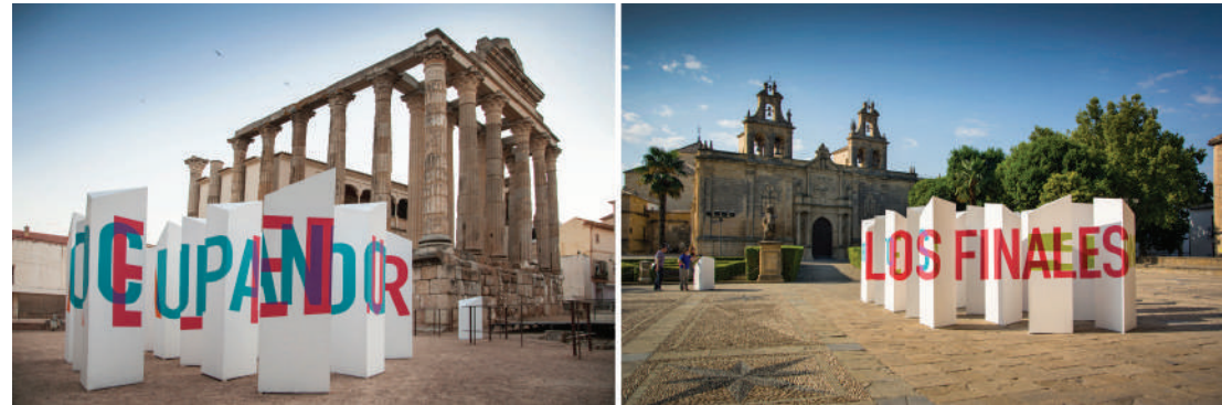
Fig. 18 - Laberintos Liricos , World Heritage Cities, Spain, 2016-2017. Left, Ocupando , Mérida; right, Los finales , Úbeda (by Boa Mistura).

Author is truly grateful to Boa Mistura for granting the interview and for what the collective does through its art with deep sensitivity. All images courtesy of Boa Mistura.