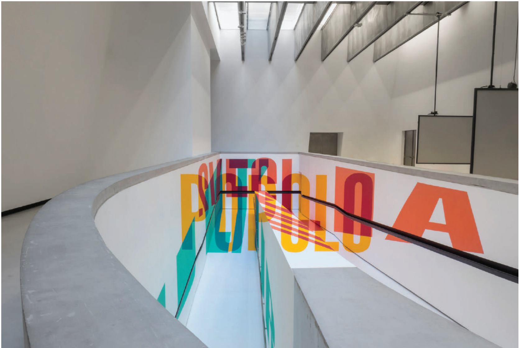
Fig. 16 - Cultura / Sveglia / Popolo , Roma, Italy, 2018. Popolo (by Boa Mistura).