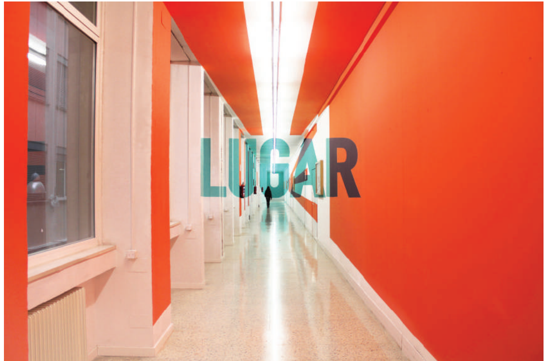
Fig. 5 - Lugar/Tiempo , Madrid, Spain, 2018. Lugar (by Boa Mistura).

words are revealed by traveling through space in the two opposite directions (fig. 5).