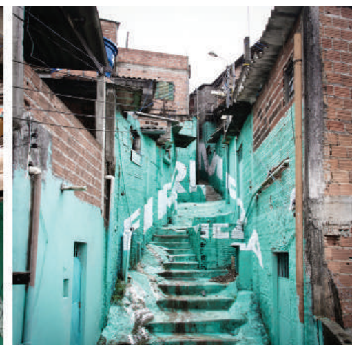
Fig. 8 - Luz nas vielas , São Paulo, Brazil, 2012. Firmeza (Boa Mistura).