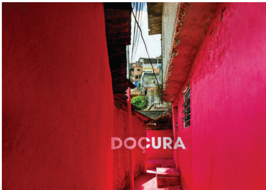
Fig. 10 - Luz nas vielas , São Paulo, Brazil, 2012. Doçura (by Boa Mistura).

baggage, would be impossible to intervene. It is beautiful that such a technical and mathematical process produces such a magical result.