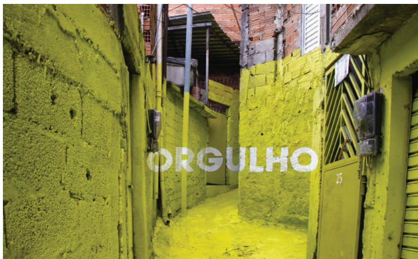
Fig. 11 - Luz nas vielas , São Paulo, Brazil, 2012. Orgulho (by Boa Mistura).

In the second place, the point of view is chosen in a natural way. To make anamorphism work, the different planes must be arranged without cracks. If any gaps appear, anamorphosis does not work. That is why there is a millimetric task looking for that specific point where everything is arranged, where anamorphism works and the succession of planes generates an interesting deformation in the original work.