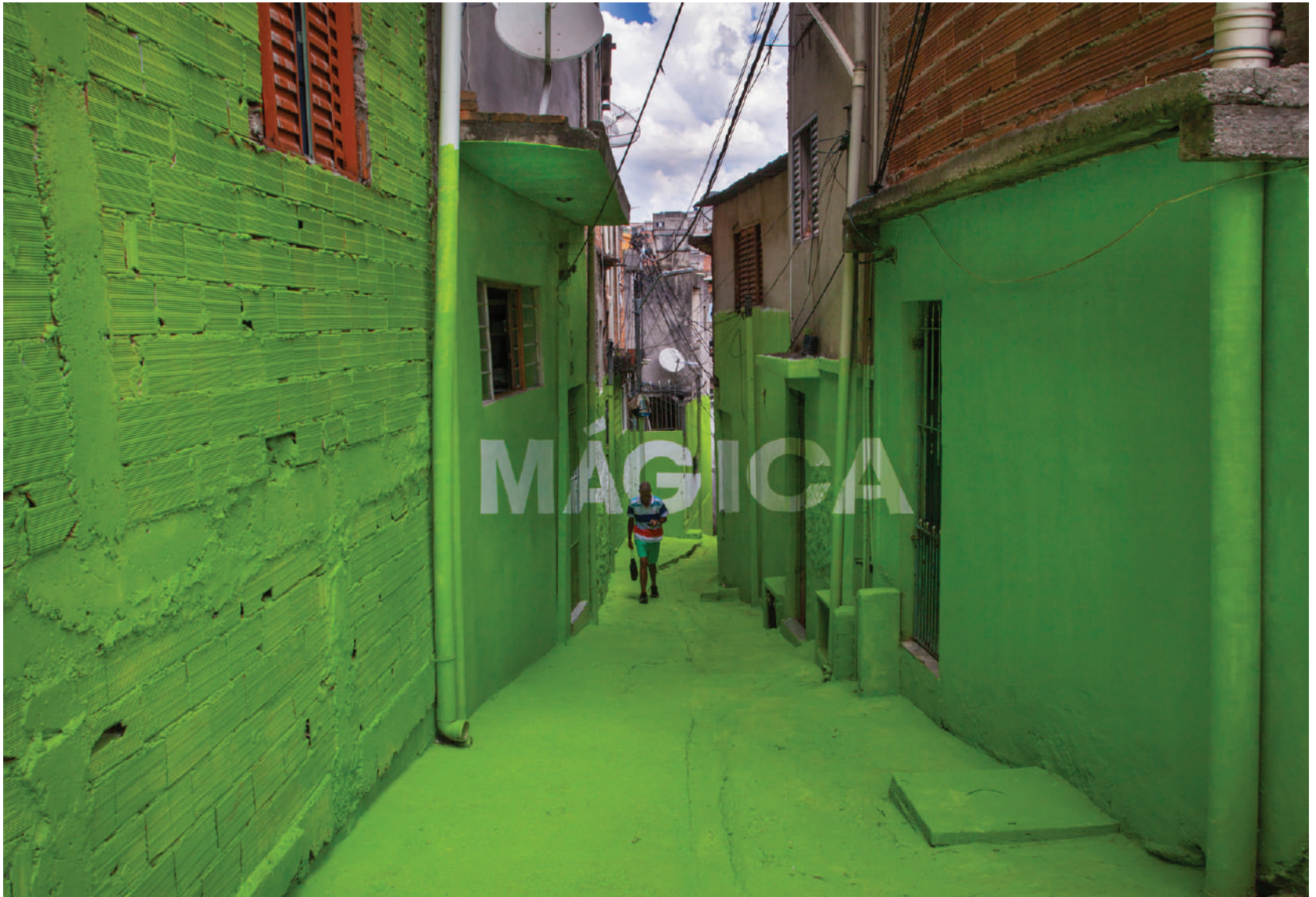
Fig. 12 - Luz nas vielas , São Paulo, Brazil, 2017. Mágica (by Boa Mistura).