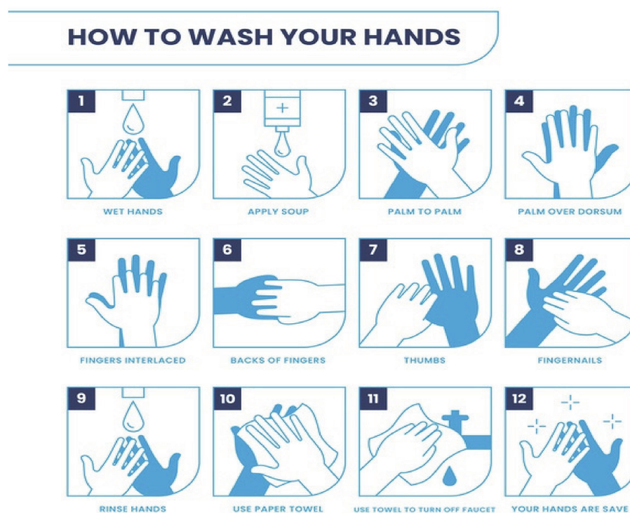
Figure 2. Correct procedure for washing hands.

Hands should be washed with soap and water for at least 40–60 s; if soap and water are not available, a 62%–71% alcohol-based hand disinfectant can also be used (Figure 2).