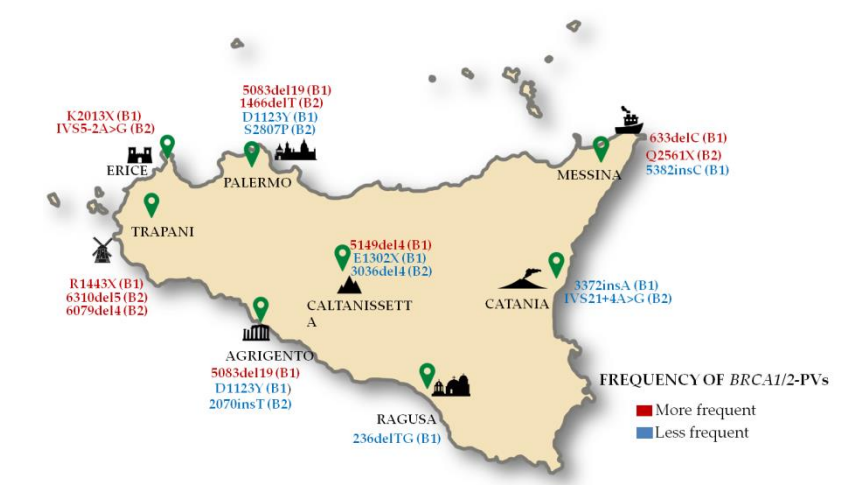
Figure 3. Geographical distribution of the hereditary breast/ovarian cancer families in Sicily.