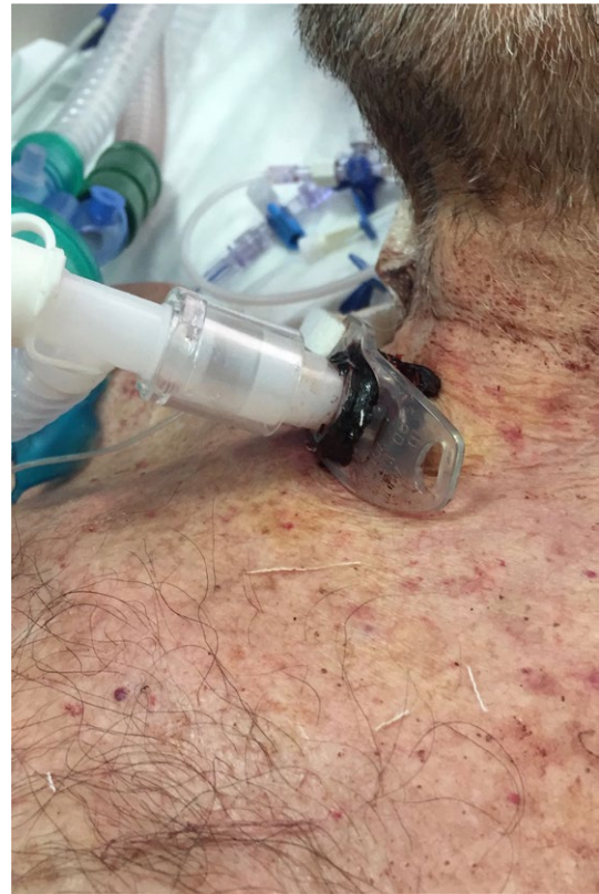
FIGURE 1 This picture shows peri-tracheostomy clotted blood without residual bleeding 30 min after the administration of rFVIIa

Since its commercially availability in 1995, recombinant activated factor VII (rFVIIa) has been used a rescue therapy in several cases where conventional therapies failed. 6 The “on label” use in Europe is intended for patients with hemophilia A and B, for treatment of congenital factor VII deficiency and for Glanzmann's thrombasthenia. 5 However, the use of rFVIIa has been also extended to those cases in which patients presented