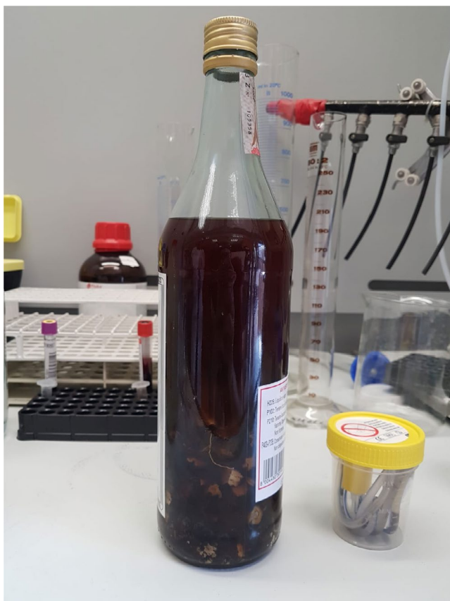
FIGURE 1 Aconitum bottle provided by the relatives

Deeper investigations on patient daily routine were then conducted, in order to identify possible causes underlying this impaired clinical status. Of note, relatives reported the accidental ingestion of a homemade infusion, which was then identified as an Aconitum (Figure 1) preparation that the patient had been using as a topical painkiller. As no antidotes are currently available for aconitum poisoning, supportive and conservative management was performed. Supportive therapy determined fast improvement of patient's clinical condition, without the need of charcoal hemoperfusion, although its use was considered by the intensivists involved in the case. On third day of ICU stay, hemodynamic improvements, restoration of sinus rhythm, and efficient respiratory drive allowed PM removal and extubation, with subsequent referral to cardiology department for further examinations, and then discharge without any other sequelae.