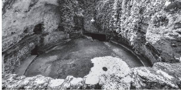
ID 088 The Sirocco's chamber of Micciulla manor in Palermo_ A bioclimatic archetype symbol of legality and civil redemption.