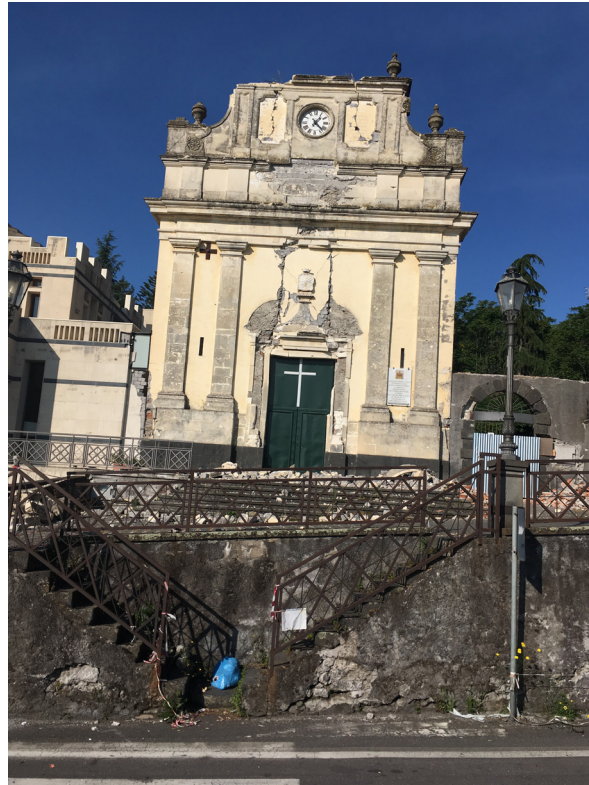
Figure 2. Church of Santa Maria del Rosario (Fleri) after the earthquake that occurred on December 2018. (Ph. Leonardo Mercatanti).