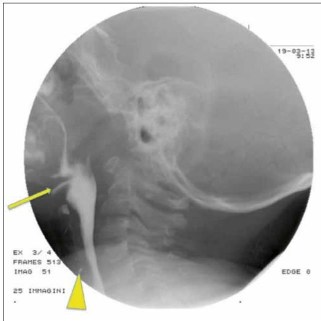
Fig. 2. Videofluorography lateral view in an 8-year-old patient with Down syndrome. During the pharyngeal phase subepiglottic penetration (arrow) and aspiration are demonstrated with persistence of contrast media in the trachea (arrowhead), in the absence of coughing.

bolus flow event related to the oropharyngeal phase of swallowing 45 55 56 (Fig. 2).