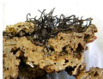
Fig. 2. Cross-section of calcarenite with roots system above