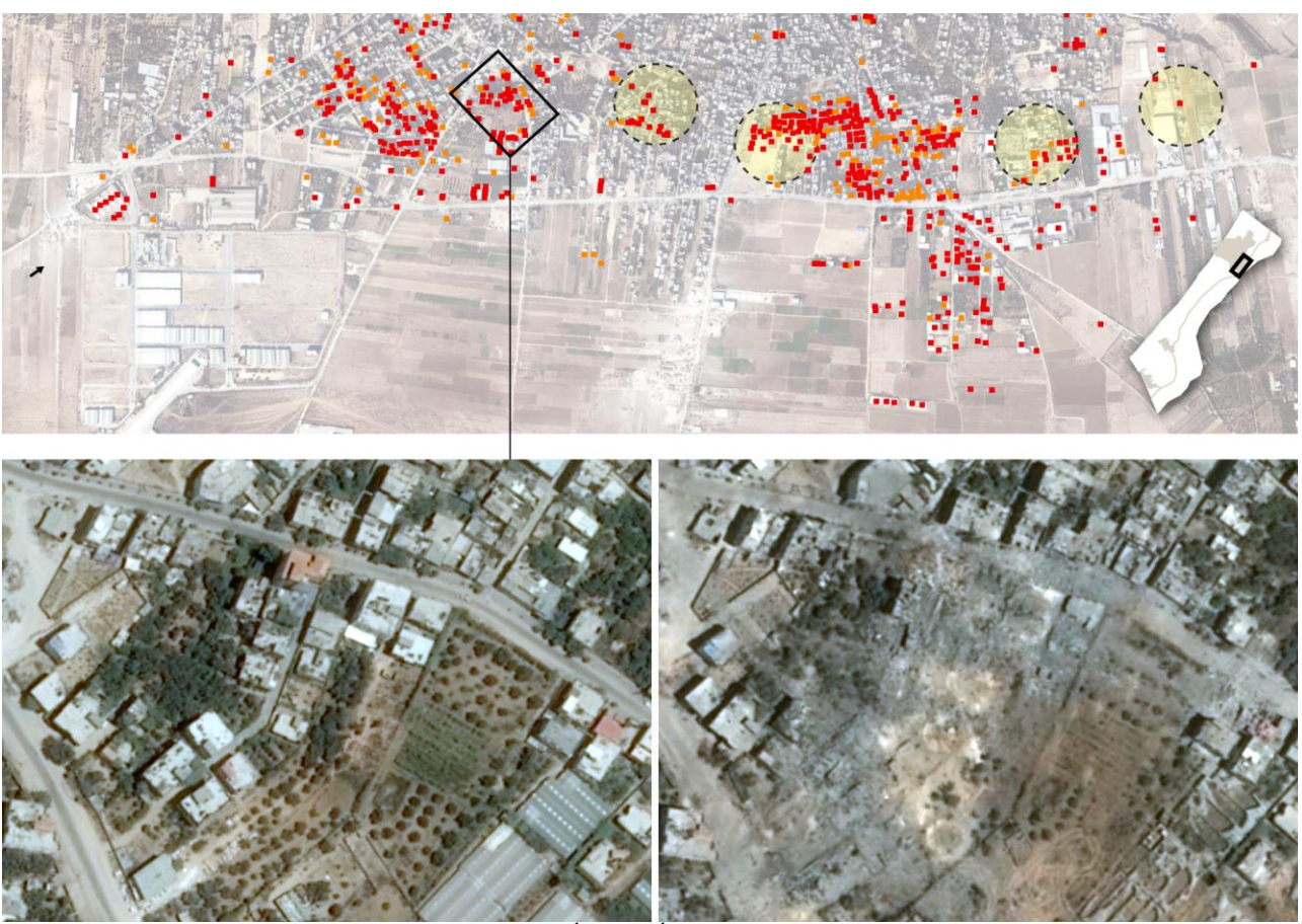
Figure 3: Compared satellite imagines, from 6<sup>th</sup> to 25<sup>th</sup> July 2014, http://osimint.com/2014/07/27/assessin; the-damage-in-gaza.

In this general trend, earth architecture is already began as a tool to face the critical social housing situation, even in Palestine, where this choice is additionally encouraged by the difficulties of importing building materials (steel, concrete, etc.), and by the high financial and environmental costs of the natural stone.