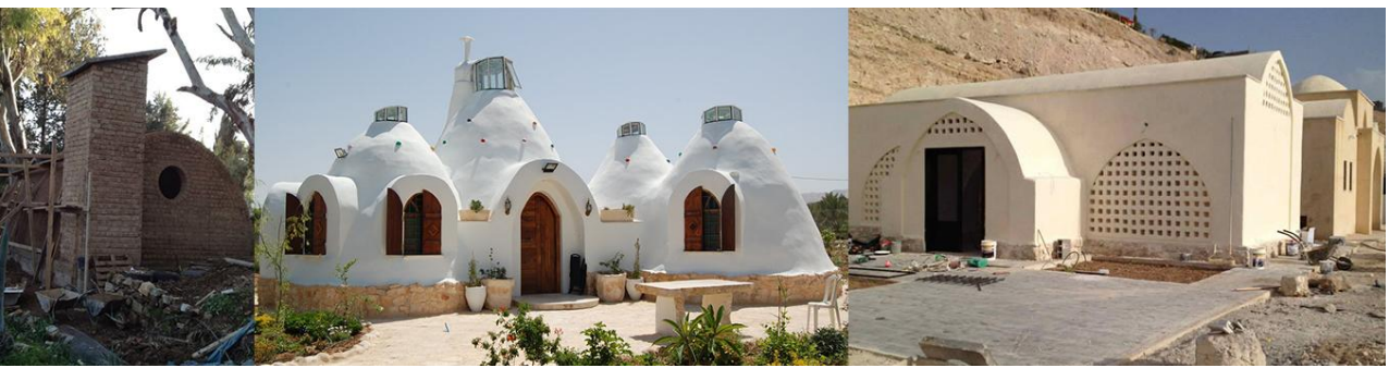
Figure 5: New earthen buildings in Jericho and Ramallah, Palestine (Shams-Ard Shams-Ard environmenta design studio).