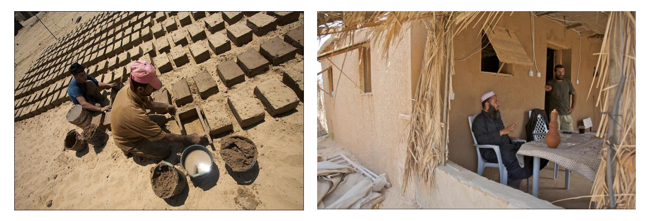
Figure 6: Earth production and earthen house in Gaza, Palestine.

The aim to reviving earthen architecture in Palestinian social housing so far has mostly regarded the building of new houses. The refurbishment of the existing houses, damaged by attacks or inadequate for various requirements, is a more complex objective that could produce wider results.