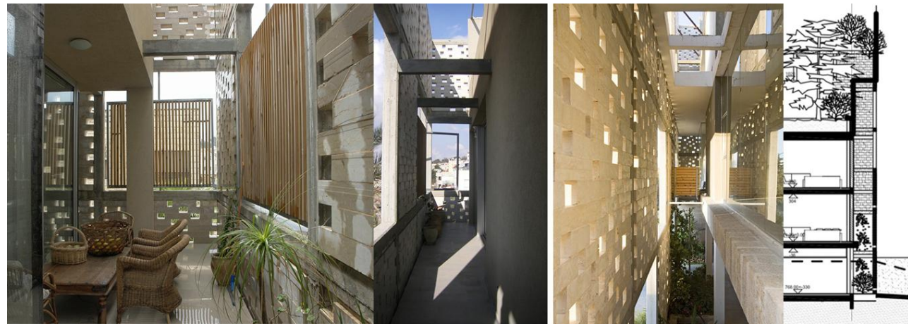
Figure 8: Mashrabiyya house in Jerusalem, Palestine, www.herskhazeen.com/the-mashrabiya-house.