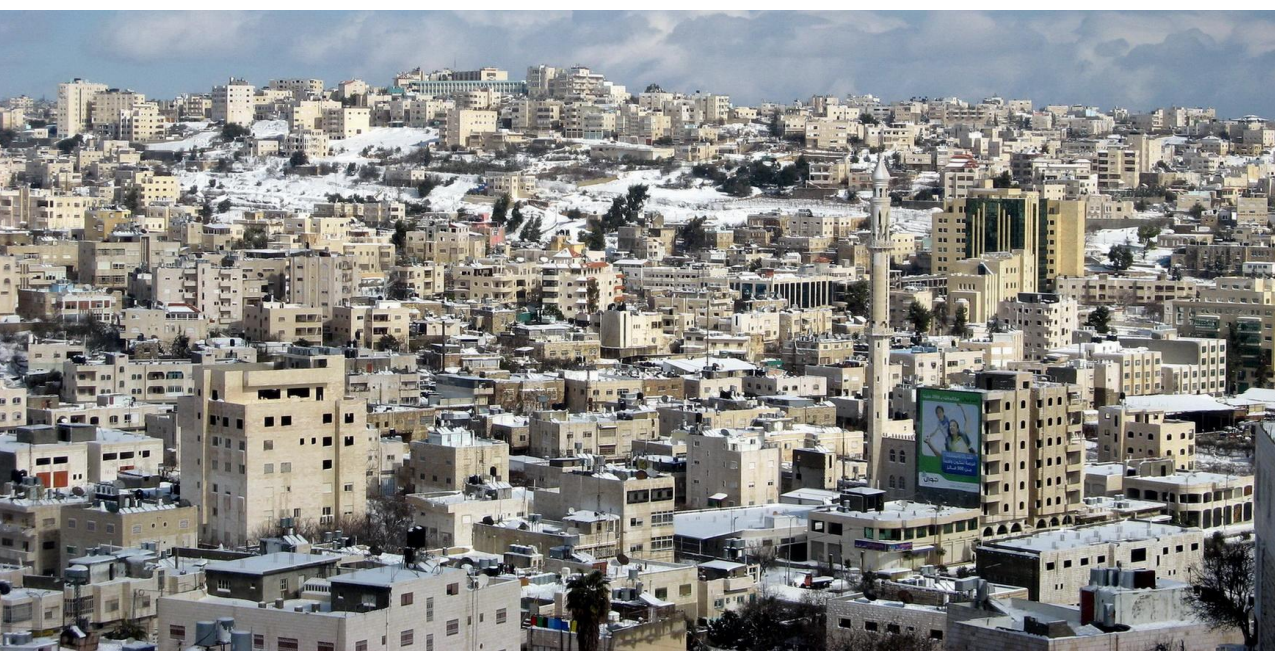
Figure 2: Contemporary urban fabric of Hebron city, Palestine.