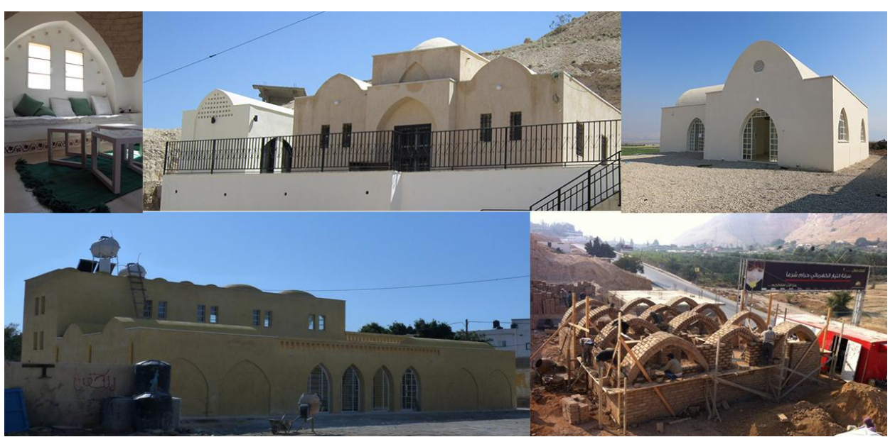
Figure 4: New earthen buildings in Ramallah, Jericho, and the Jordan Valley, Palestine.