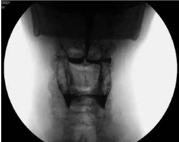
Figure 3. Videofluorographic swallowing study in the frontal view in a 66-year-old male with Alzheimer's disease shows retention of contrast media in valleculae and pyriform sinuses

in the pharynx and retention of CM in valleculae and/or pyriform sinuses (Figure 3) [21].