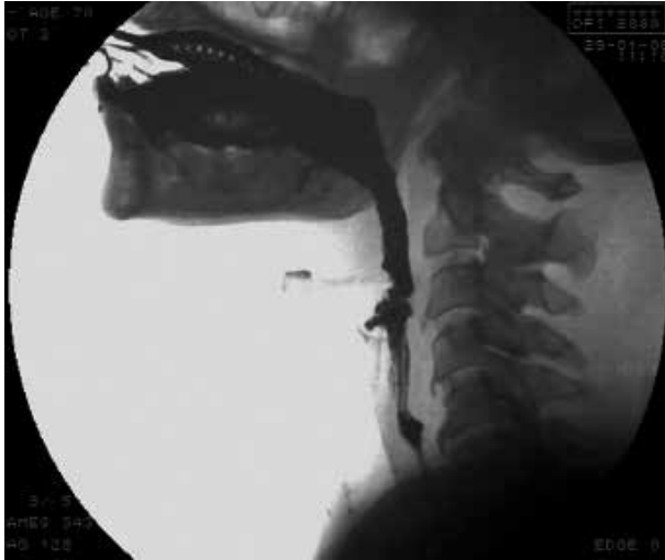
Figure 6. Videofluorographic swallowing study in the lateral view in a 70-year-old female with myasthenia gravis shows progressive weakness of palatal-pharyngeal muscles after a few swallows, associated with a delayed swallowing reflex and premature bolus pharyngeal leakage

facial nerves, leading to severe deterioration of the oropharyngeal phase [50].