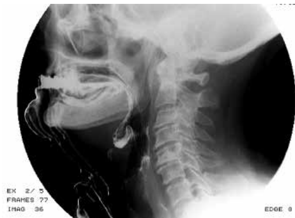
Figure 4. Videofluorographic swallowing study in the lateral view in a 71-year-old female with Parkinson's disease shows drooling and contrast media retention in the valleculae