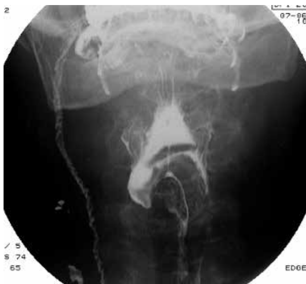
Figure 1. Videofluorographic swallowing study in the frontal view in a 75-year-old male with amyotrophic lateral sclerosis shows an asymmetry in epiglottal tilting and aspiration

Anomalies in oral stage swallowing are common in all types of dementia and may be present as functional disor-