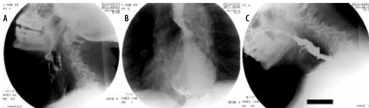
Figure 2. Videofluorographic swallowing study in the lateral view in an 83-year-old female with amyotrophic lateral sclerosis shows spillover of contrast media (CM) in the upper airway due to anomalies in epiglottal tilting and laryngeal elevation when the patient’s head is extended (A). Oesophageal dyskinnesia with non-propulsive tertiary waves (B); slight reduction of the spillover of CM in the upper airway when the patient’s head is flexed (C)

Anomalies in pharyngeal reflex and in airway protection mechanisms occur only in the late stage of the disease [14,16,17]. VFSS often shows delayed passage of the bolus