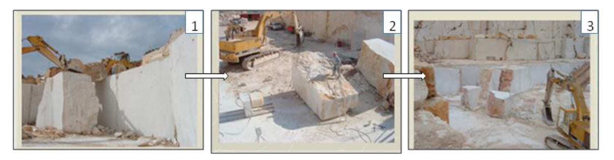
Fig. 2. Illustration of the three steps of the excavation of "Perlato di Sicilia".

The excavation of the "Perlato di Sicilia" marble essentially comprises three steps: 1) cutting of a big "slice" of rock (this operation is carried out using a diamond wire that is constantly cooled down by water and moved by electric sewers); 2) removal and tipping of this "slice" onto the quarry area (this operation is executed by widening the cut through explosive); 3) squaring of the "slice" in blocks according to standard sizes that are suitable for being loaded onto proper trucks and being transported to the next processing plants (this operation is carried out using diamond wire saws). In Figure 2 the sequence of these three steps is shown.