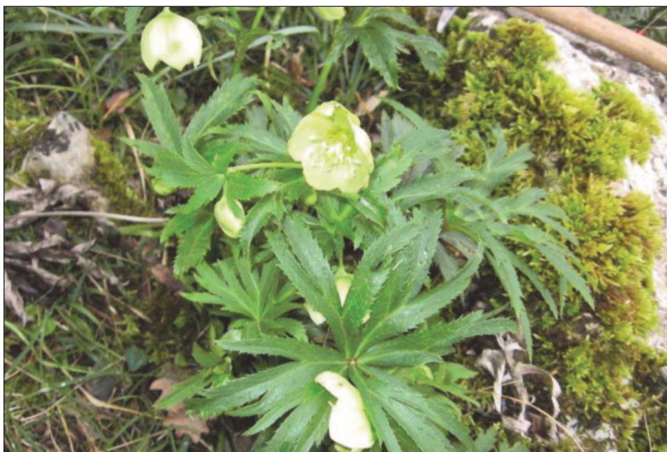
Fig. 1. Helleborus bocconei subsp. intermedius in the locality Grotta del Garrone (Piana degli Albanesi, Palermo).

The examined materials were collected in different seasons, between April and September 2010, in the locality Grotta del Garrone, near Monte Pizzuta (Piana degli Albanesi, Palermo).