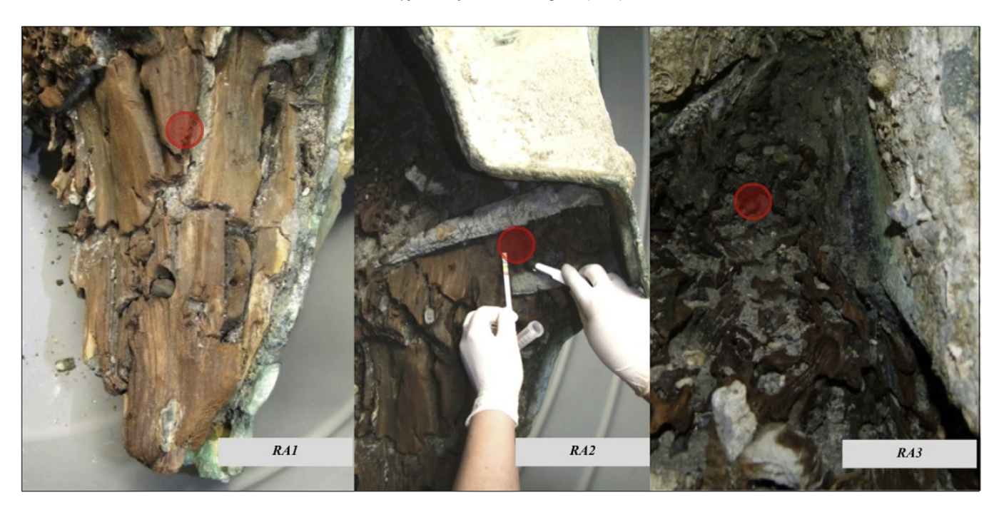
Fig. 1. Wood fragments sampling from different areas (pointed in red) of the wood rostrum structure.

F. Palla et al. / Journal of Cultural Heritage xxx (2013) xxx-xxx