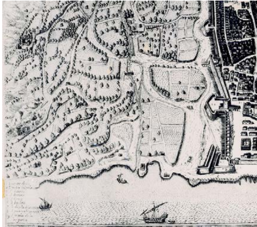
Figure 3. The Arcs of Saint Ciro.

woods, forests and the Macchia (Mediterranean shrubland) probably occupied most of the territory. In fact, it's important to specify that we don't know the exact borders of the "old park" even though we do know that beyond the Eleuterio river laid the Rebuttone feud. More to the west, on the Moarda coast, was the palace of Altofonte. It had two streams, which still exist today, and was surrounded by forests and/or shrublands that reached all the way to, and comprised, the territory adjacent to Partinico. It is now necessary to establish a point of reference to deepen our excursion and this could be represented by the map drawn by Orazio Maiocco of which we know the edition published by Marco Duchetto in 1580/1602 (fig.3).