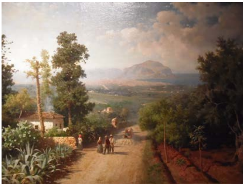
Figure 5. Francesco Lojacono (Palermo, 16 maggio 1838 –Palermo, 28 febbraio 1915), Ph.: Muesse - Galleria d’Arte Moderna(Palermo-Italy). You can see the centenarian olive tree on the right. The poplars on the left. In the background the dark green of the first citrus groves.