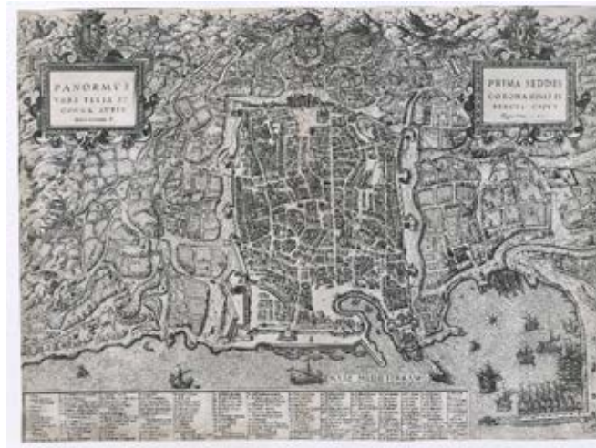
Figure 1. Map of Palermo and of Conca D'Oro by M.F. Cartari – Rome 1581. Right: the Maredolce's site, the bridge 'of the Admiral' (ponte dell'Ammiraglio) and 'Conca D'Oro' limits.

This image coincides, if only in part, with the descriptions given by Arab and medieval geographers. It also coincides with the activity of Norman, Suebi and Aragon kings who paid great attention to the use and maintenance of woods and forests. Even in the first cartographic representation (Pietro da Eboli, n.d., rep. 1994) the royal gardens — iconographically represented in a single quadrant — are illustrated with flowers, rare plants and predatory animals (lynx).