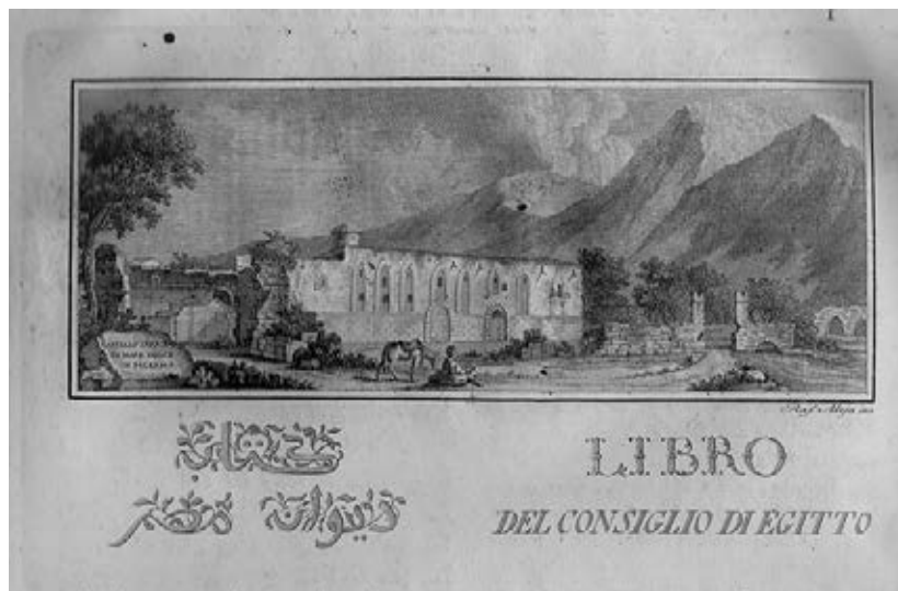
Figure 6. Drawn by Dufourny from original by Raffaello Ajola Castello Saraceno di Maredolce in Palermo. Gabinetto Disegni e Stampe, Palazzo Abatellis Regional Gallery, Palermo, n. D313.@

Another element that can’t be ignored is the finish of the royal palace: white stucco. This is certain because until the progressive renovation of the palace won’t scrape away the last layer of plaster, it’ll be possible to imagine the external appearance of the building. It’s therefore possible to observe that Maredolce was also covered in white stucco, as was Altofonte. The city still has a wall today that, until a few years ago, shined because of the bright white finely decorated with ‘conci’ (Meli, 1990). The big building complex, being the king’s private property, was not open to the public.