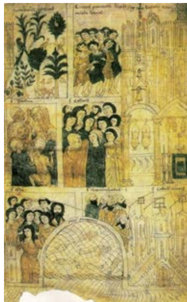
Figure 2. Funerals of William II. Neighborhoods of the ancient Palermo during Normans. Liberad Honorem Augusti di Pietro da Eboli, Berna Biblioteca Civica.

This image coincides, if only in part, with the descriptions given by Arab and medieval geographers. It also coincides with the activity of Norman, Suebi and Aragon kings who paid great attention to the use and maintenance of woods and forests. Even in the first cartographic representation (Pietro da Eboli, n.d., rep. 1994) the royal gardens — iconographically represented in a single quadrant — are illustrated with flowers, rare plants and predatory animals (lynx).