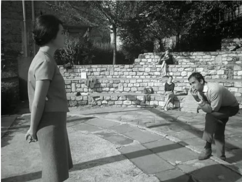
Fig. 2. Rehearsing Pericles