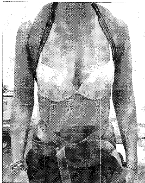
Figura 10.2. Corsetto dinamico dorso-lombare con spallacci.