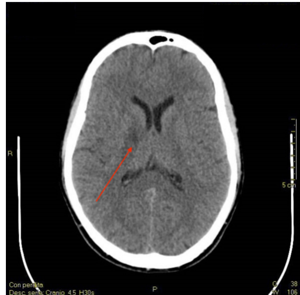
Figure 1. Brain CT scan showing a slight hypodense area in the right internal capsule (red arrow).

Our findings may suggest that BH diving, in associations with a thrombophilic state due to hyperhomocysteinemia,