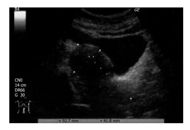
Figure 1 Echo tomography of gastric region. A solid hypoechogenic mass with a diameter of 2.7 cm × 2.2 cm protruding from beyond the anterior wall of the stomach.