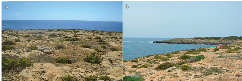
Figure 3. Habitat of Biton velox along the south-eastern shoreline of Lampedusa (a, b).

Our survey confirms the presence of a living population of solifuges at Lampedusa more than 60 years after its first published record. The determination of our sample was not free of problems in the context of the unresolved taxonomy within the Daesiidae family. Above all, it is puzzling that Roewer (1961) did not notice the discrepancy in the tarsal formula –