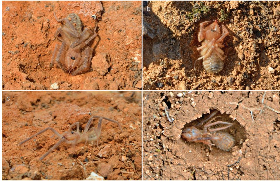
Figure 4. Live specimens of Biton velox in their natural habitat in Lampedusa (late April). (a, c) Two males. (b) A female. (d) A male in its burrowed cell, probably during moulting.

established by him to discriminate between Daesiidae genera – when he determined that the Lampedusa specimens belonged to the genus Biton . This fact may be justified by Roewer's focus on diagnostic characters now considered of little taxonomic value (cf. Helversen & Martens 1972; Brignoli & Raffaelli 1978). Besides, we consider completely unreliable the record of B. ehrenbergi , which Roewer (1961) based only on a few females and on the unverified taxonomic value of body-size. We too argue for a taxonomic revision of Daesiidae. However, the current state of solifuge taxonomy allowed us to identify the taxon living in Lampedusa exclusively as B. velox .