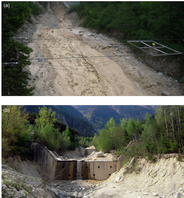
Figure 2. Debris-flow EWS Illgraben (Canton VS, Switzerland): (a) the debris-flow detection system in the upper part of the catchment (b) the lower part of the catchment with warning system.

time is short. The alarm decision is based on a predefined threshold. One of the first such systems was implemented in the region of the Nojiri River, Japan (Itakura et al., 1997; Fig. 1). A more recent prominent example is the Illgraben debris-flow alarm system in Canton Valais, which protects people crossing the channel from debris flows as they are detected (Fig. 2). Here, sensors are installed in the upper catchment to detect ground vibrations and an increase in flow depth that indicate an ongoing debris flow, to trigger an alarm in the form of flashing lights and audible signals at channel crossings further downstream, and to send text messages to local hazard managers (Badoux et al., 2009). Alarm systems are often installed to prevent damages caused by natural hazard processes that may be rapidly triggered such as debris flows, snow avalanches, glacier lake outburst floods and rock falls.