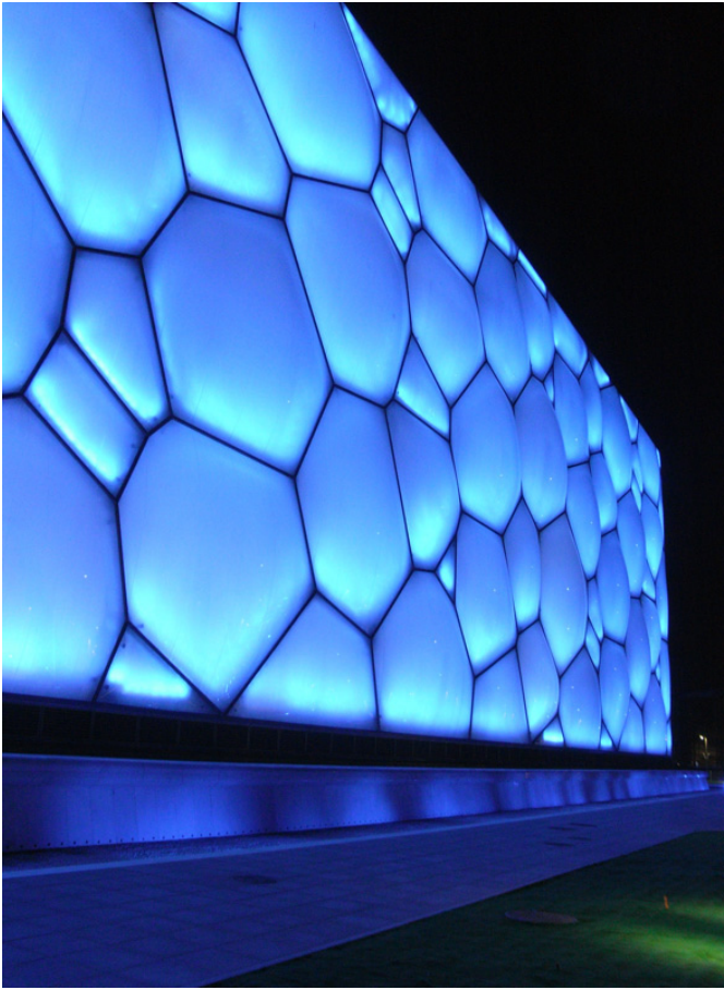
6 . The Digital Water Pavilion in Saragossa (2008)