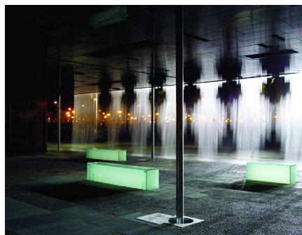
3. Water Glass/House (1995)