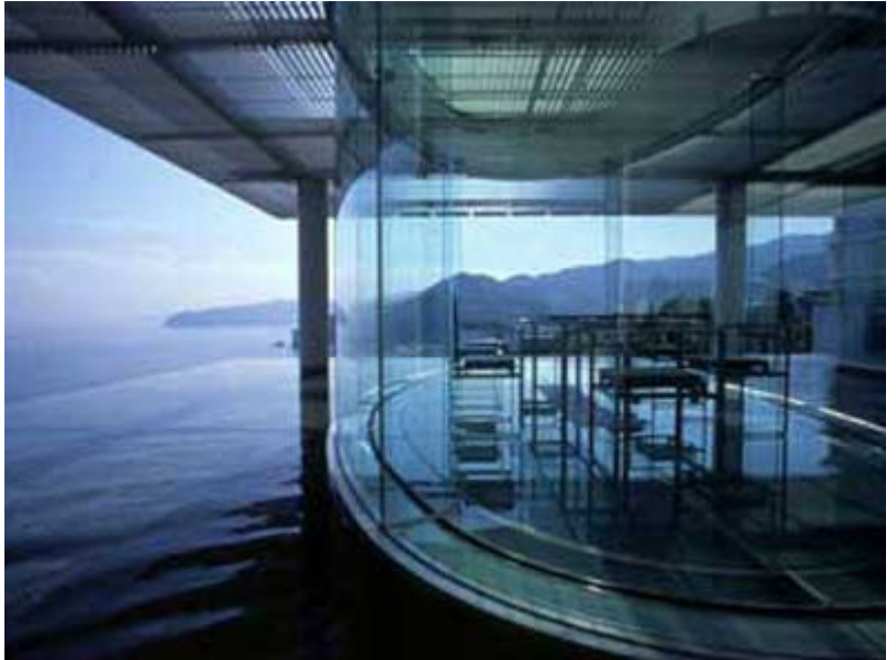
7 . Water Cube (2008)