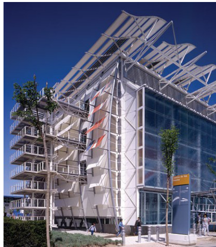
1 - 2 . The British Pavilion in Seville (1992)