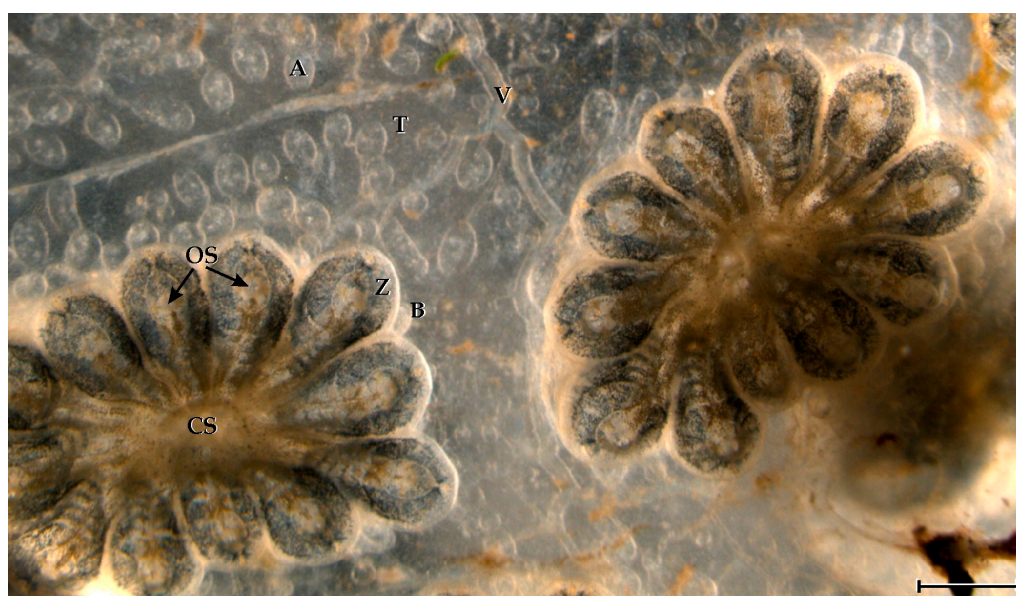
Figure 1. Colony of the ascidian Botryllus schlosseri . In this species, zooids are grouped in star-shaped systems (two systems are visible here), and stem cells assure the rejuvenation of the colony through either the cyclical production of pallial buds, or the whole body regeneration (also known as vascular budding), when all the zooids and buds are ablated and new zooids originated from the hemocytes in the tunic vasculature. A: ampulla (blind, contractile ending of the tunic circulation); B: bud; CS: cloacal siphon of the system; OS: oral siphon of the zooids; T: tunic; V: tunic vessel; Z: zooid. Scale bar: 1 mm.

Recent studies have shown that the best organisms for stem cell research are the marine/aquatic invertebrates. These organisms possess numerous types and lineages of stem cells that can offer, once studied in the lab, important clues to the understanding of stem cell biology. Stem cells are present in either (morphologically) simple marine/aquatic organisms, such as cnidarians, sponges, and flatworms, or in anatomically more complex taxa, such as crustaceans, echinoderms, and protochordates (urochordates and cephalochordates) (Figure 1). Unique to many of the aforementioned marine invertebrates is the property that some adult MISCs are pluripotent, capable of developing both the germ line and somatic tissues, and are involved in asexual reproduction and regeneration. Marine organisms challenge the prevailing dogmas on stem cell structures, niches, and cell lineages biology. They also challenge the existing concepts on the genetic and epigenetic control of stem cell differentiation. Due to their simpler morphological and tissue organization and the accessibility of some of them to genetic manipulation, marine/aquatic invertebrates are reliable and efficient model systems to investigate the molecular basis of stemness and stem cell regulation. This problem can be solved by analyzing the molecular interactions between stem cells and their niches, under controlled in vivo conditions.