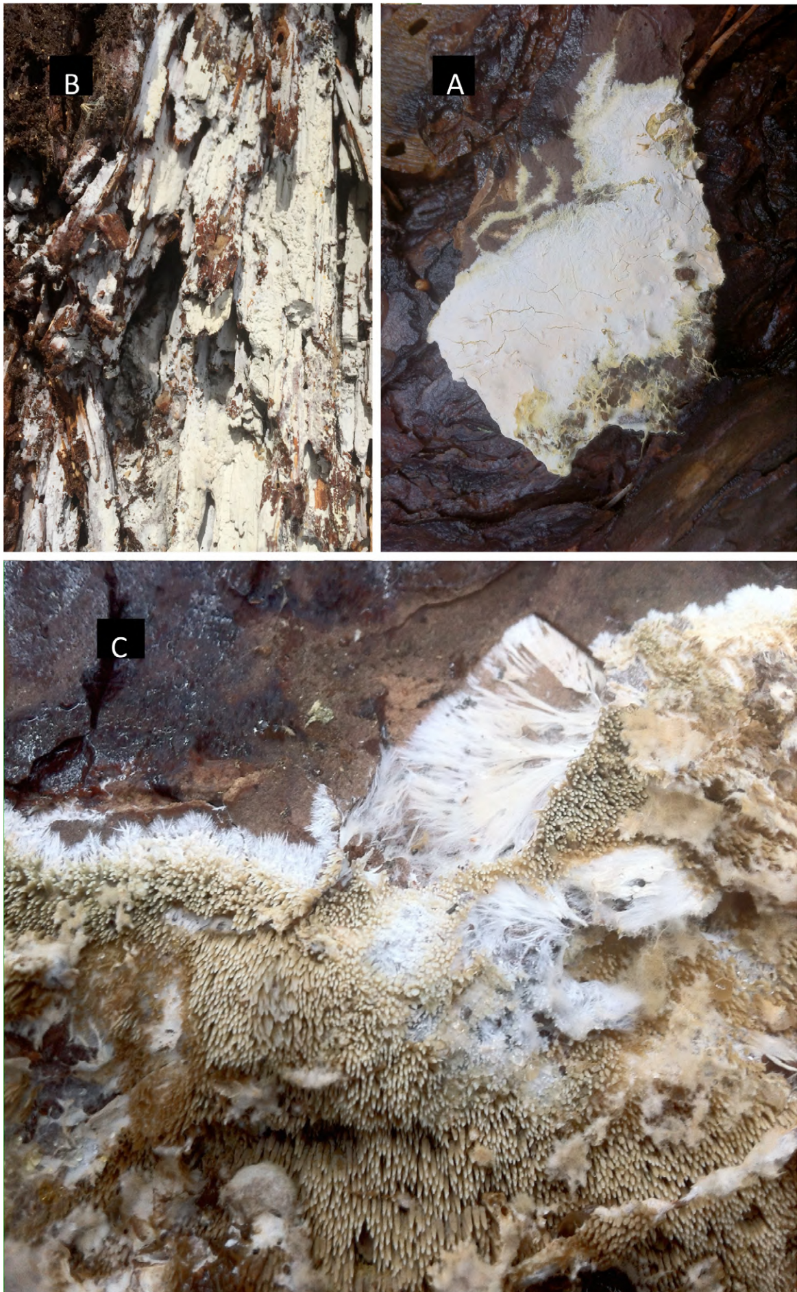
Figure 4. A: Leptosporomyces mutabilis . B: Tubulicrinis calothrix . C: Kavinia alboviridis .