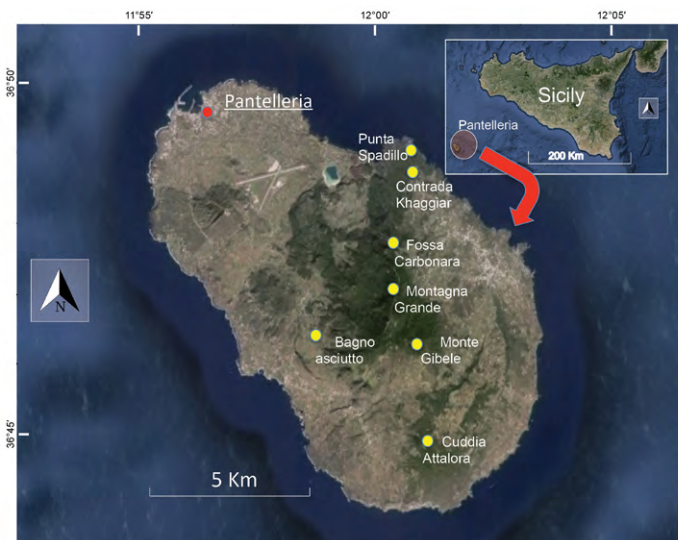
Figure 2. Location of the investigated area (Pantelleria, Sicily) with localities of collections.

Twenty-five corticioid species new to Sicily are listed here in alphabetical order. Included are ecological and distributional data for each taxon. Including these 25 new records, 127 corticioid fungi are known from Sicily.