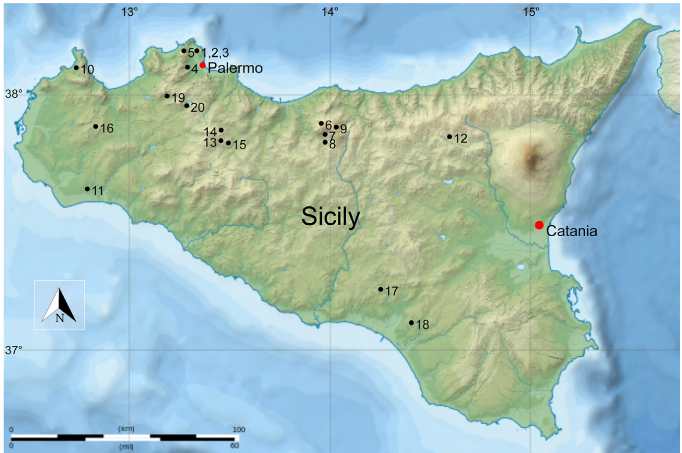
Figure 1. Location of the investigated area (Sicily) with localities of collections (1-20). 1: Monte Pellegrino. 2: Bosco Niscemi. 3: Parco della Favorita. 4: Monte Petroso. 5: Mandria Zarcati. 6: Casa Munciarrati. 7: Piano Torre. 8: Monte dei Cervi. 9: Villa Salvia. 10: Monte Passo dei Lupi. 11: Birribbaida. 12: Contrada Buscemi. 13: Bivio Lupo. 14: Santa Barbara. 15: Galleria Roccazzo. 16: Monte Pispisa. 17: Monte Gibliscemi. 18: Sughereta di Niscemi. 19: Punte di Cuti. 20: Costa Lunga.