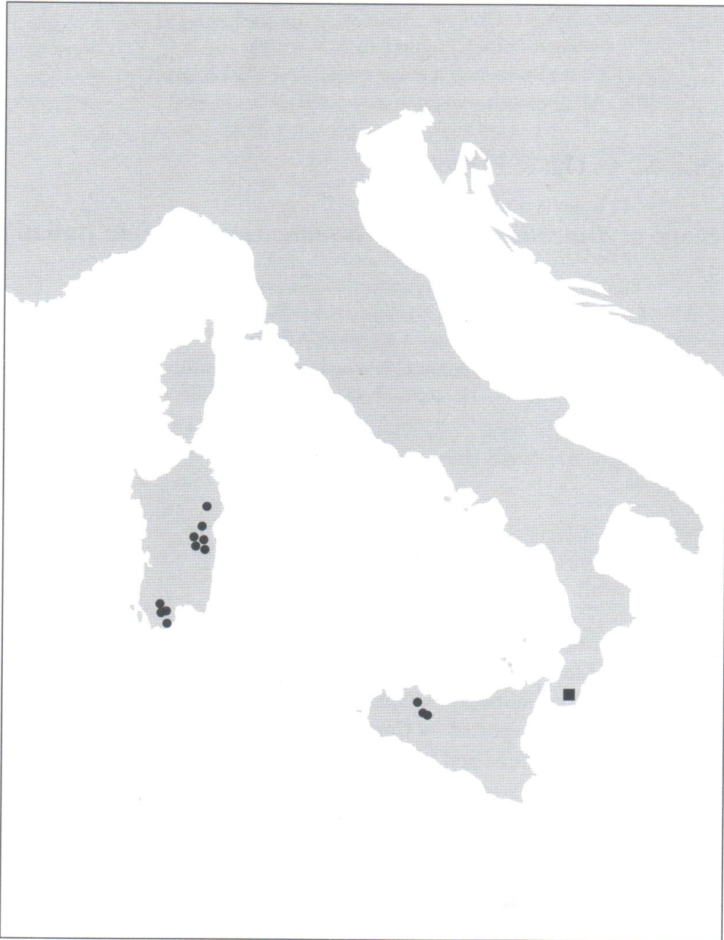
Fig.1. Italian distribution of Anacolia webbii (Mont.) Schimp.

●: localities previously known; ■ : new locality.