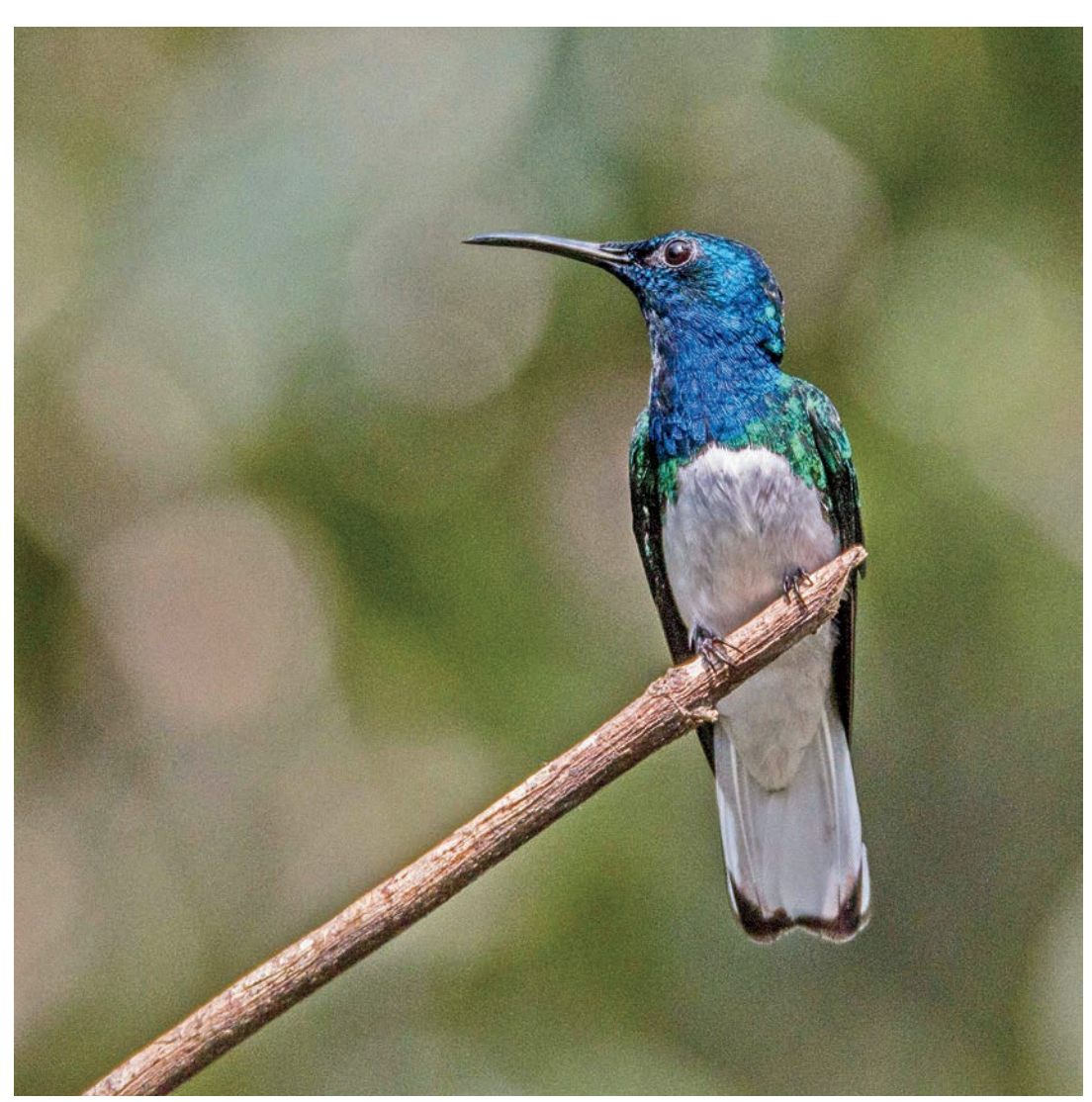
White-Necked Jacobin Hummingbird, Belize