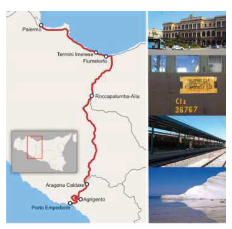
Figure 3. The third route

It is upon this third tourist route that we have focused our attention.