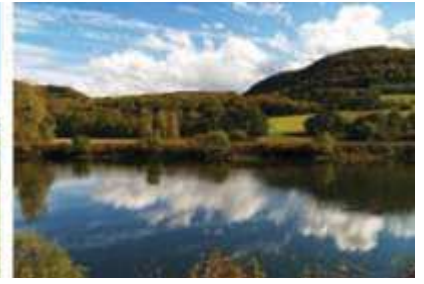
Figure 2. Examples the woodland landscape

The judgment depends very much on the familiar elements that characterize it and by culture. A good landscape produces a sense of well-being, a bad landscape produces malaise. A balanced and orderly landscape produces